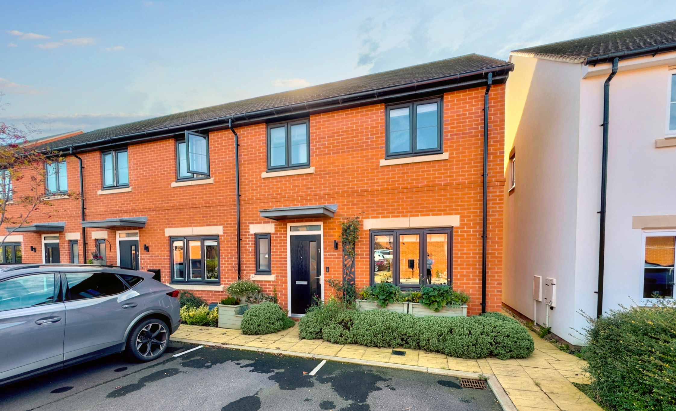
7 Clover Close, Wantage, Oxfordshire OX12 7GB Oxfordshire, Guide Price £375,000