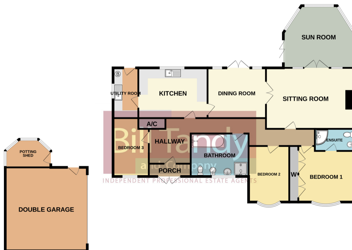
KYRIMAR LODGE, LOWER WAY, UPPER LONGDON WS15 1QG

Whilst every attempt has been made to ensure the accuracy of the floorplan contained here, measurements of doors, windows, rooms and any other items are approximate and no responsibility is taken for any error, omission or mis-statement. This plan is for illustrative purposes only and should be used as such by any prospective purchaser. The services, systems and appliances shown have not been tested and no guarantee as to their operability or efficiency can be given. Made with Metropix ©2023