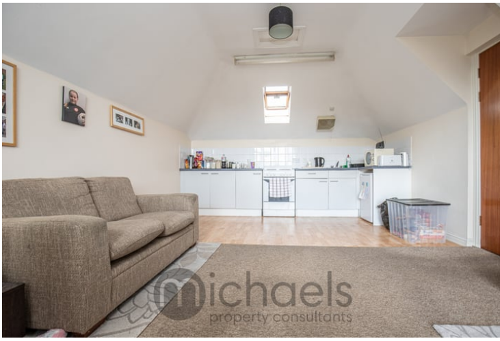
20' 5" x 12' 11" (6.22m x 3.94m)