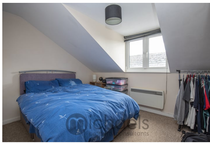
11'10" x 8'6" (3.61m x 2.59m)