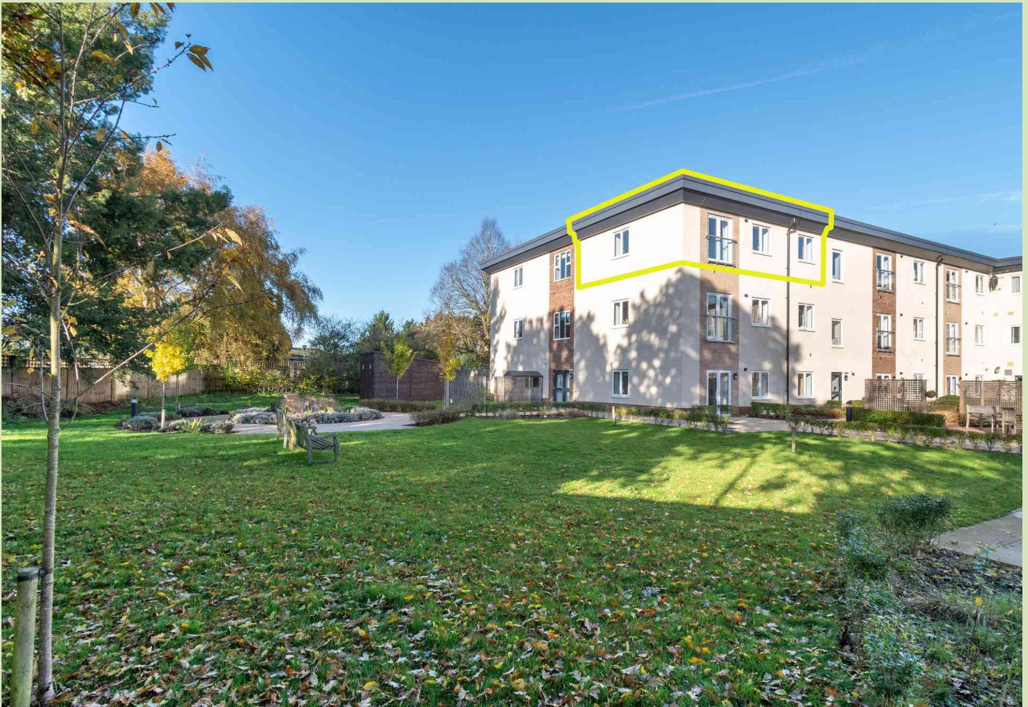
54 Meadow Walk, Fakenham Shared Ownership £172,500