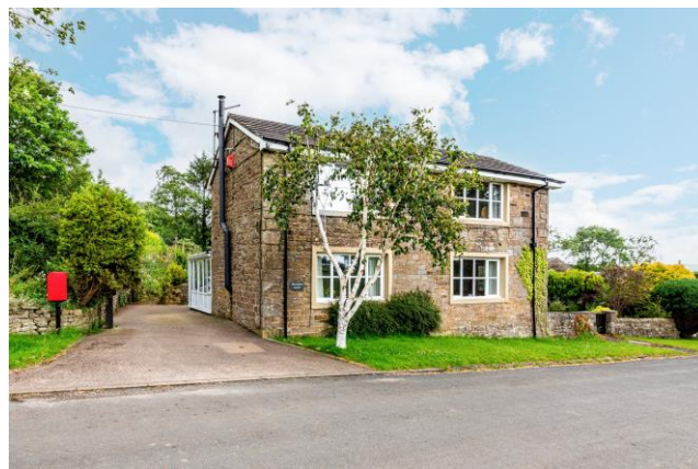
REAR & SIDE ELEVATIONS