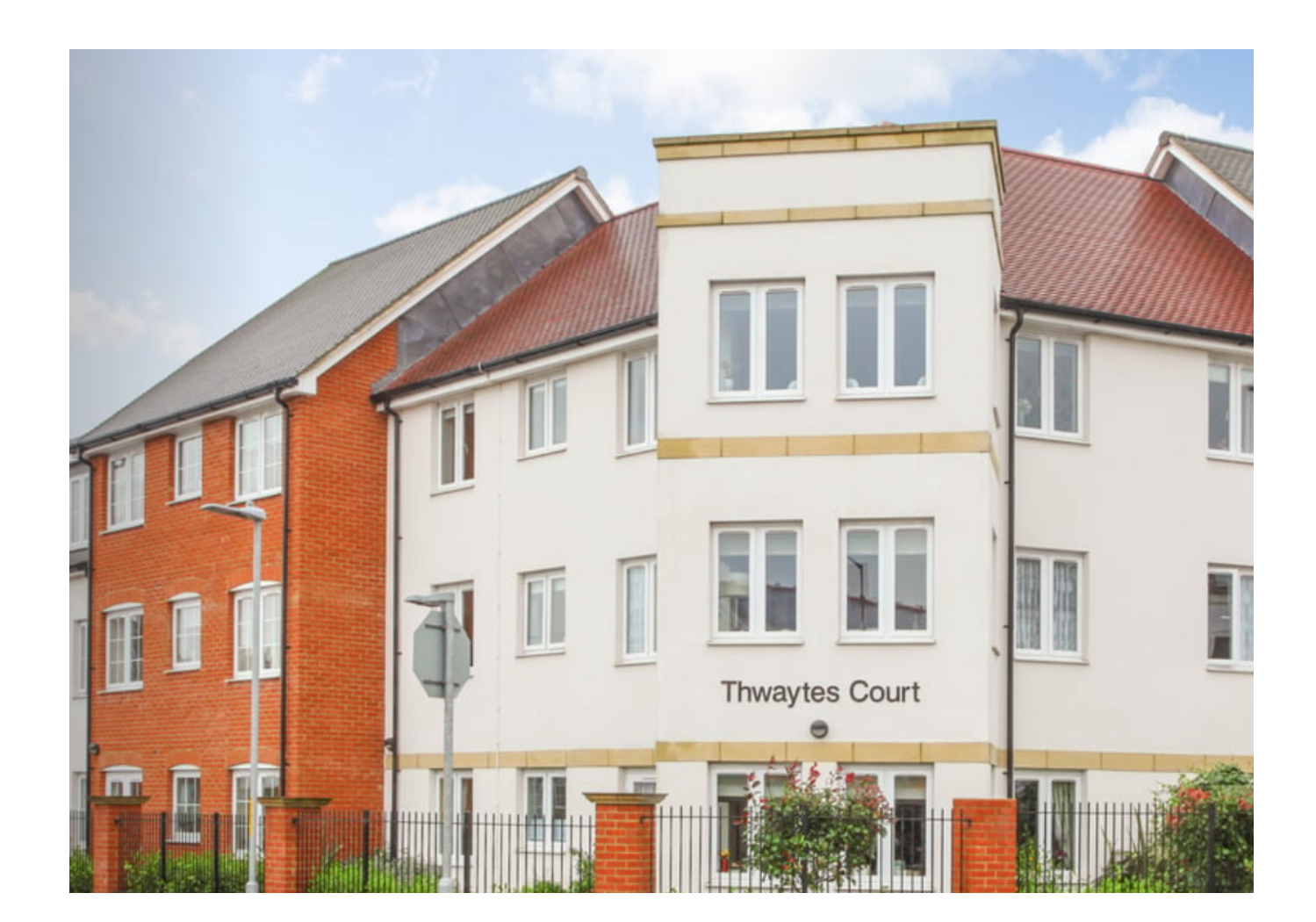
32 Thwaytes Court, Minster Drive, Herne Bay, Kent, CT6 8BF