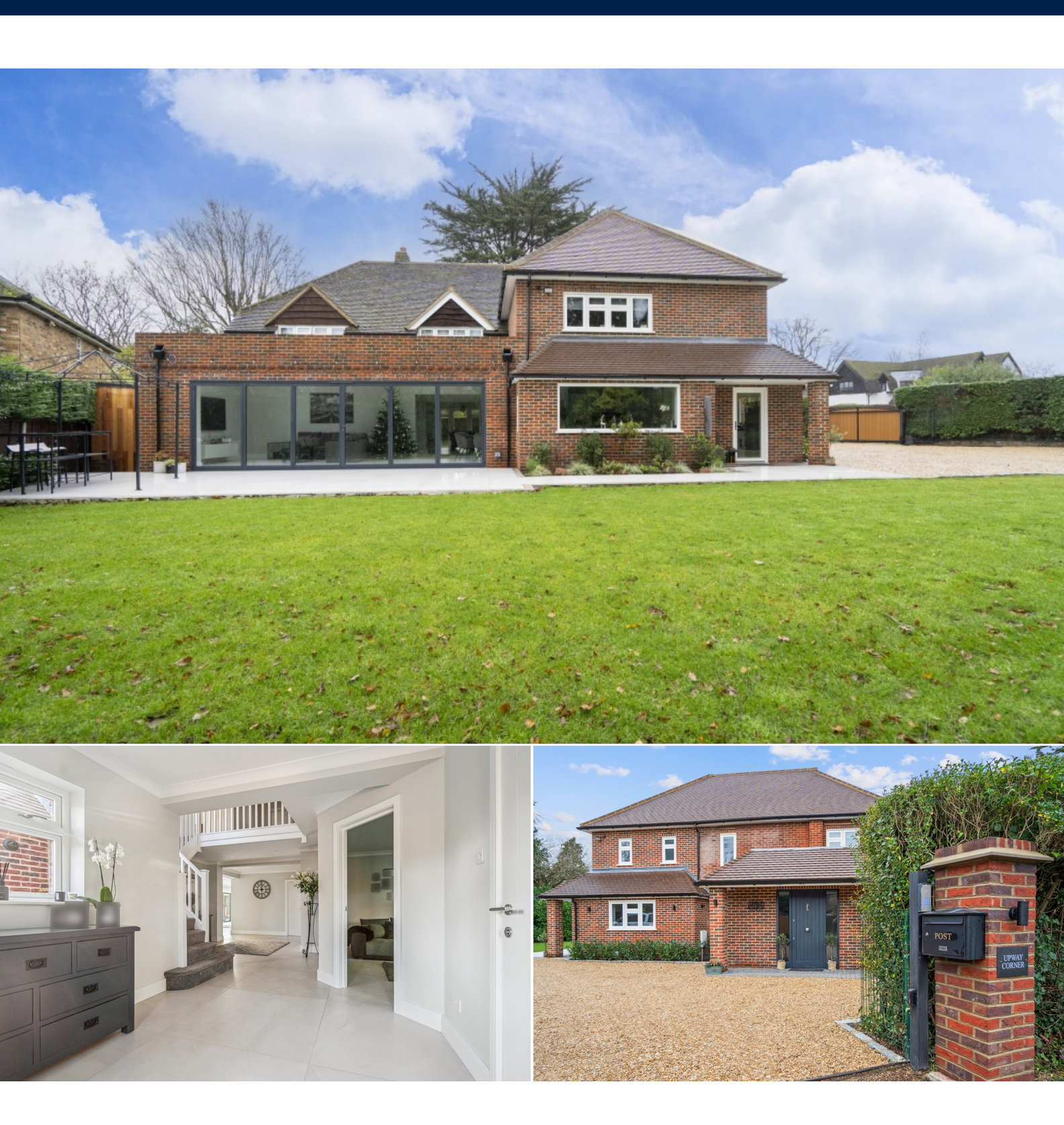
Upway Chalfont Heights, Buckinghamshire, SL9 0AG