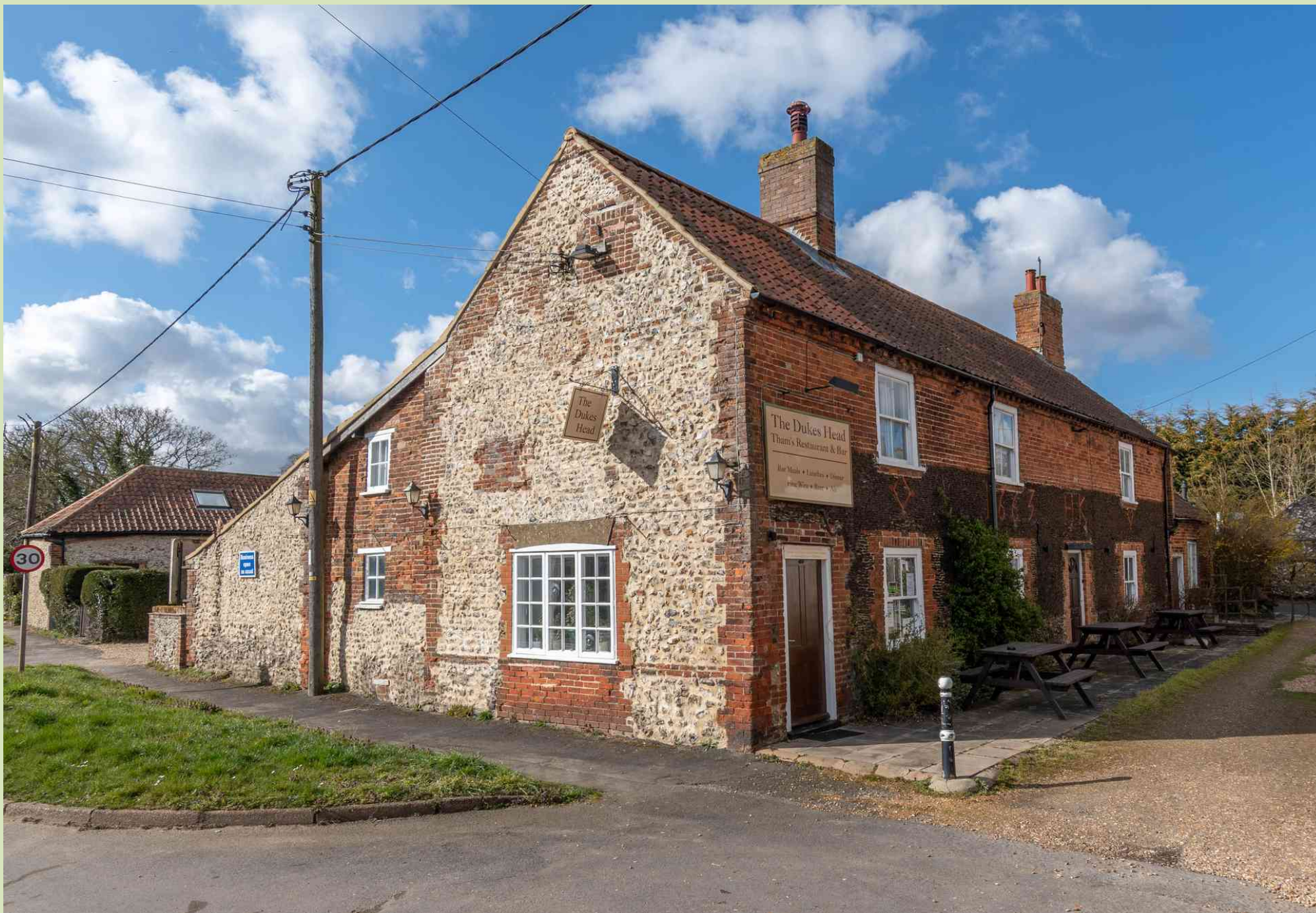
The Dukes Head, West Rudham Guide Price £350,000