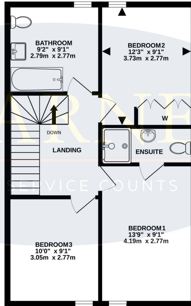
1ST FLOOR 555 sq.ft. (51.6 sq.m.) approx.