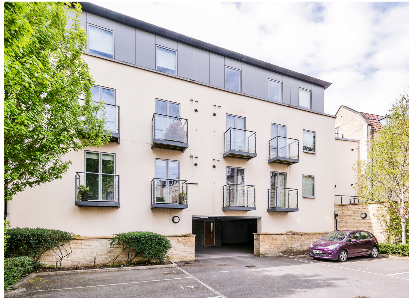
St George's House, Bath