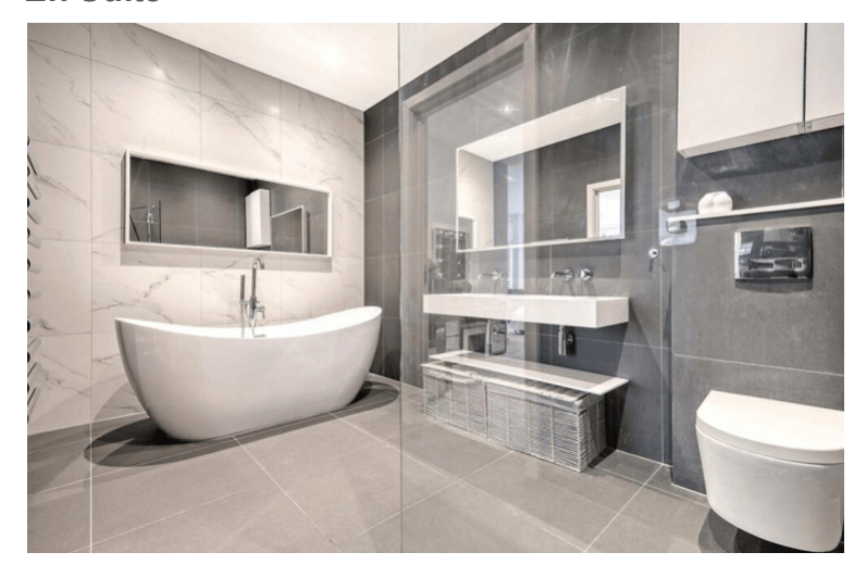
3.70m x 2.40m (12' 2" x 7' 10")