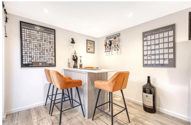
2.10m x 2.40m (6' 11" x 7' 10")