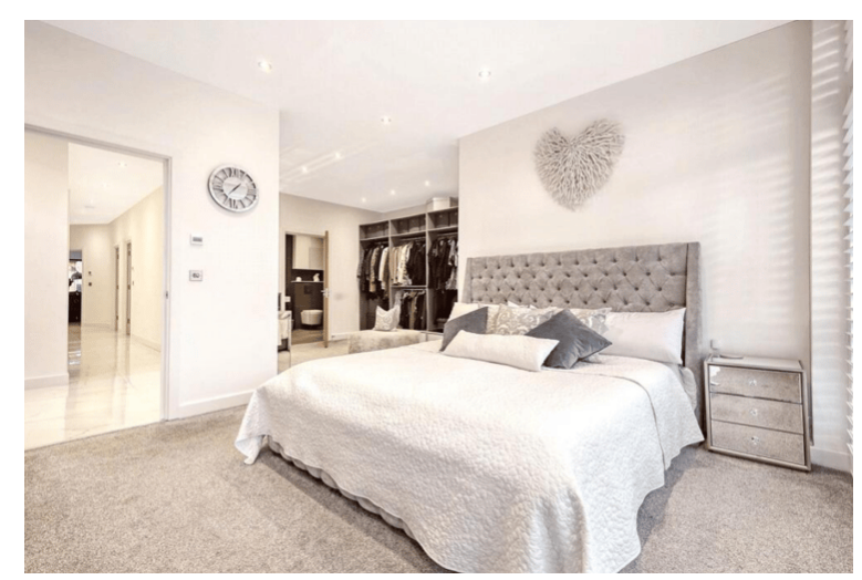
6.20m max x 6.91m (20' 4" x 22' 8")