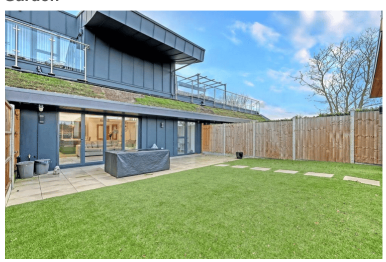
8.51m x 9.11m (27' 11" x 29' 11")