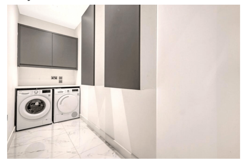
3.70m x 1.30m (12' 2" x 4' 3")