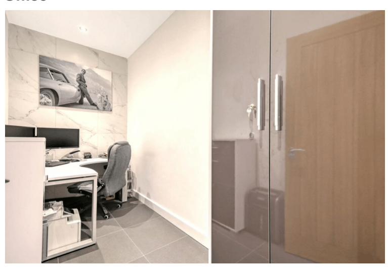
3.70m x 1.68m (12' 2" x 5' 6")