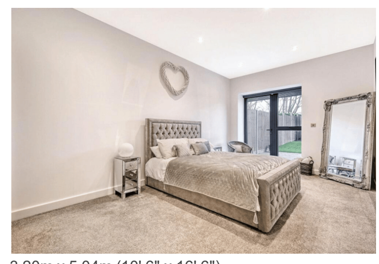
3.20m x 5.04m (10' 6" x 16' 6")