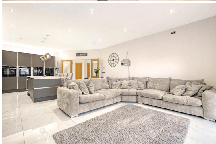
5.45m x 8.40m (17' 11" x 27' 7")