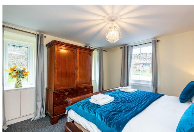
RECEPTION ROOM / BEDROOM 4