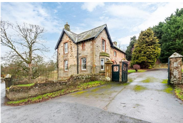
EXTERNAL AND GARDENS