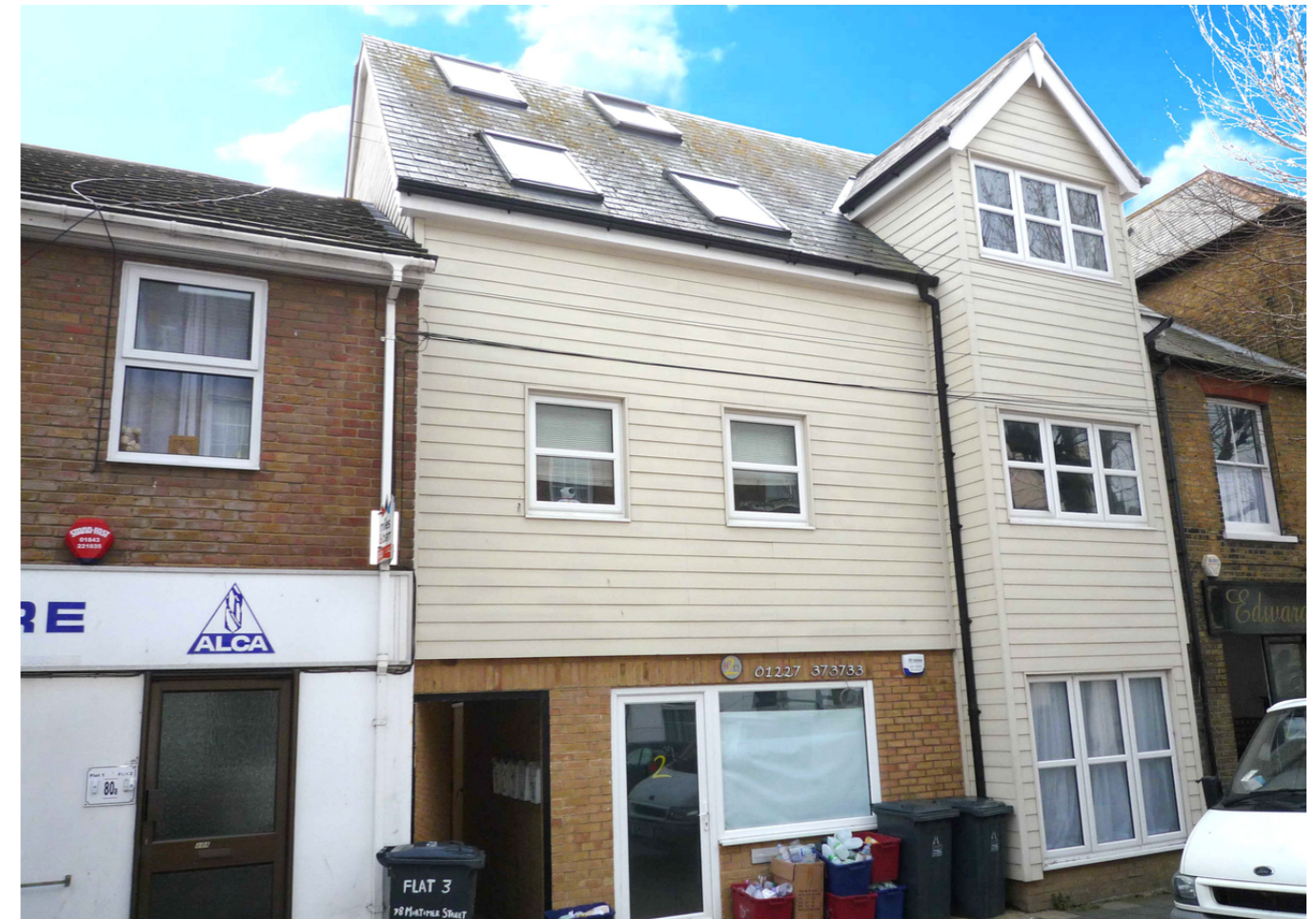
Flat 2, 74 Plenty Brook House, Mortimer Street, Herne Bay, Kent, CT6 5PS