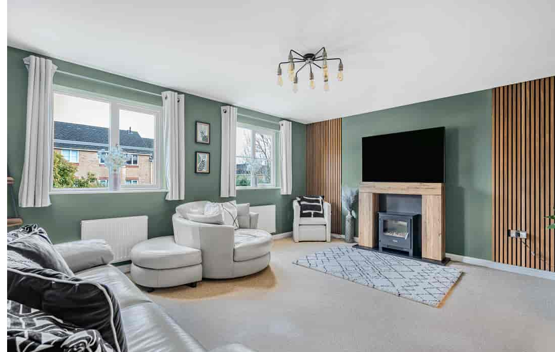
4 Princes Gate, High Wycombe, Buckinghamshire HP13 7AD £500,000 - Freehold