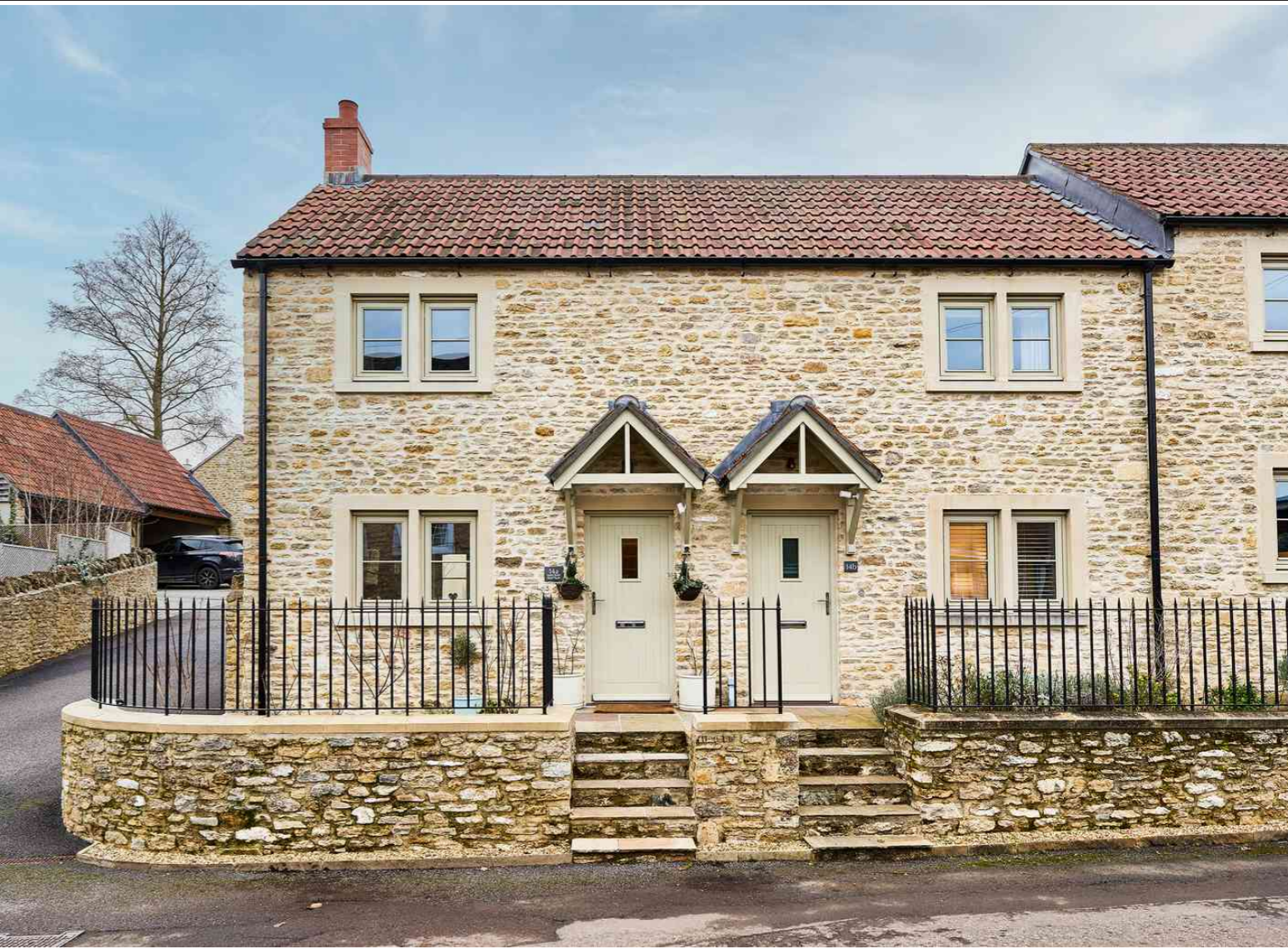
14a Lower Street, Rode