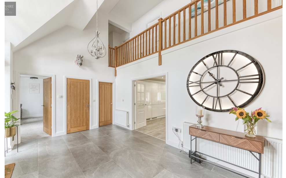
Old Nurseries Close, Belper, Derbyshire DE56 0UR £675,000 - Freehold