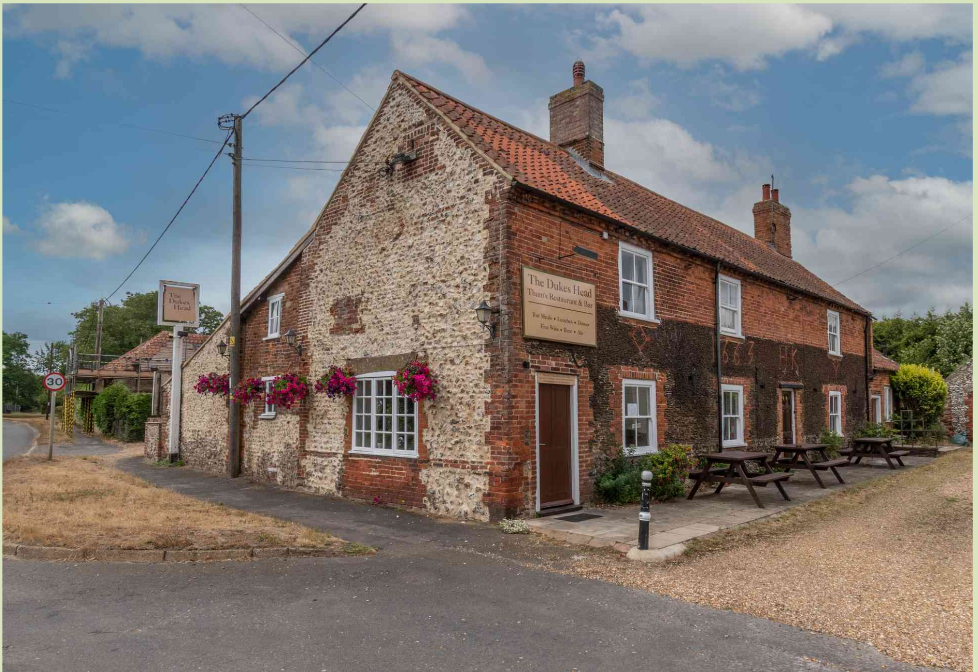
The Dukes Head, West Rudham Guide Price £385,000