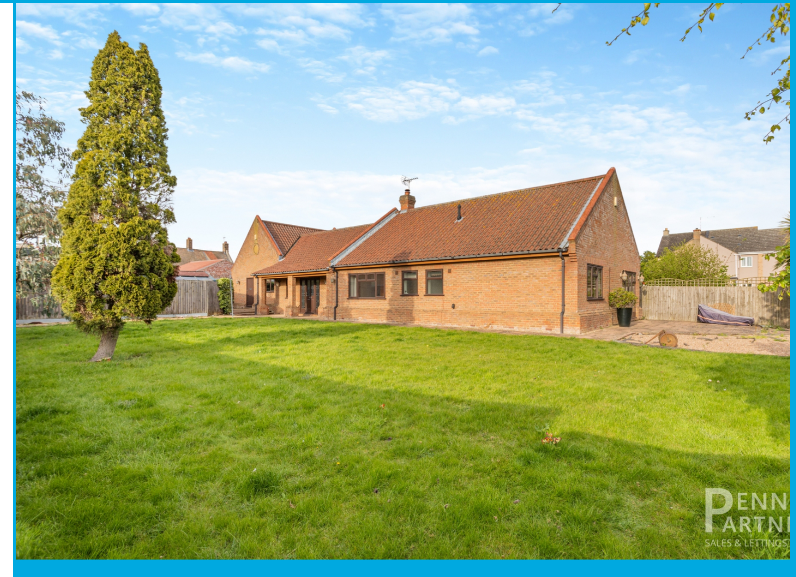
3A BRIGGATE WEST, WHITTLESEY, PETERBOROUGH, CAMBRIDGESHIRE. PE7 1DJ