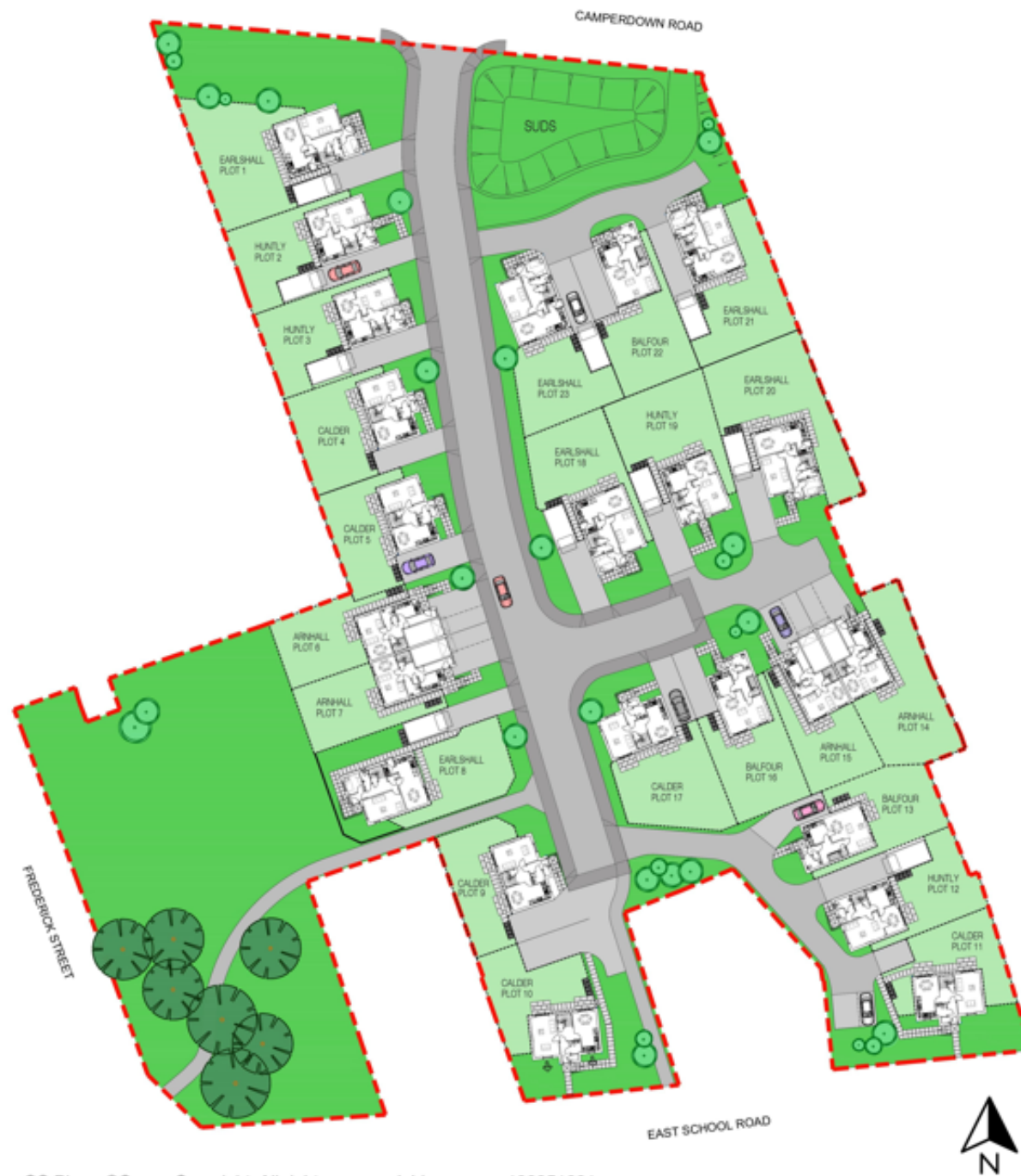
OS Plan - *This site plan is intended for illustration purposes only and is subject to changes during the construction phase