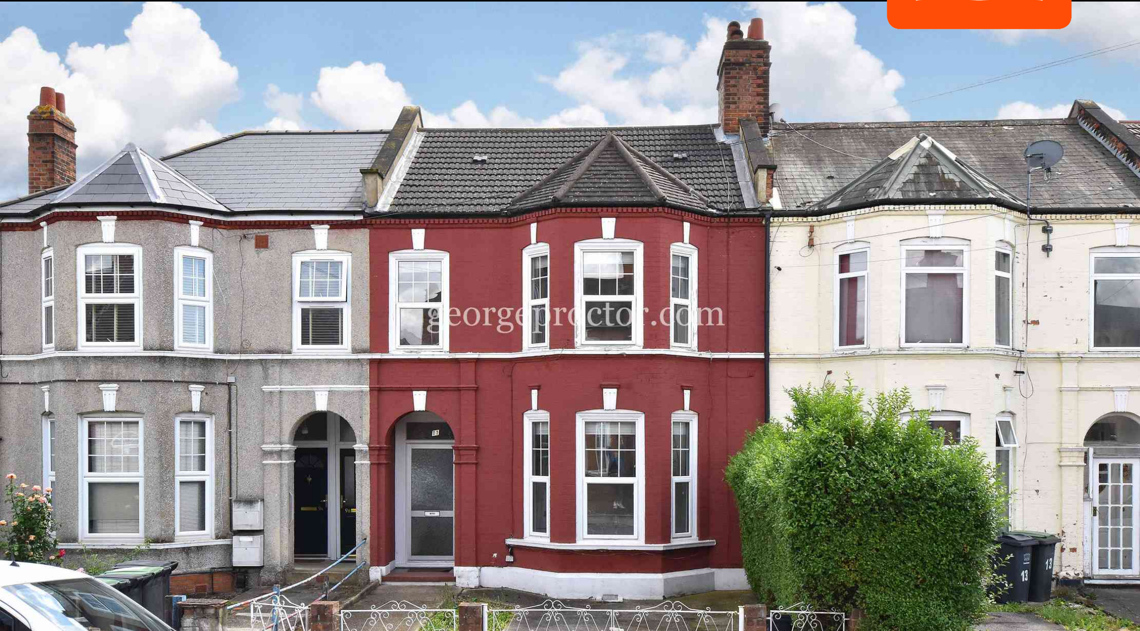
St Fillans Road, Catford, London. SE6 1DQ