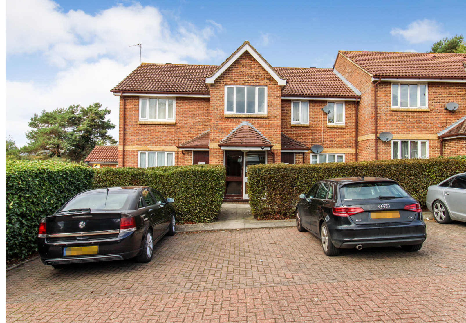
39 Waterloo Rise, Reading, Berkshire. RG2 0LW.