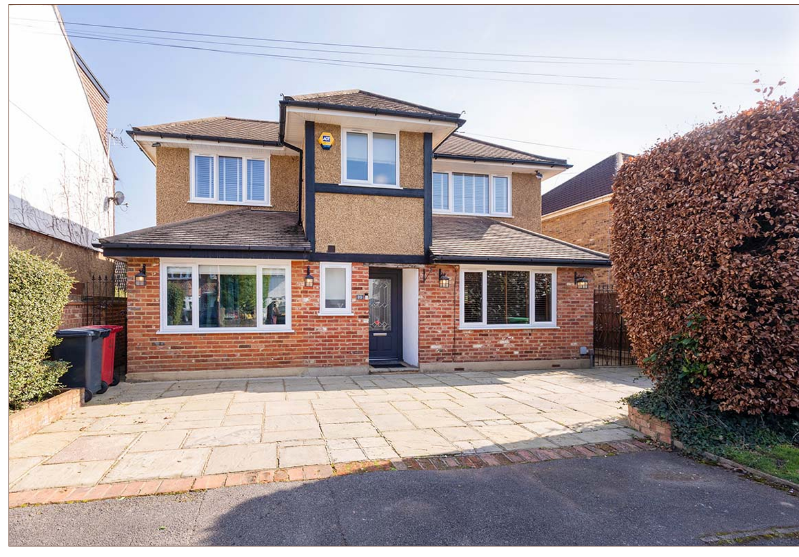
This beautifully kept detached property has been proficiently extended, creating a stunning family home suitable for a large family, and is located within walking distance of all three local grammar schools.

The ground floor comprises three reception rooms, including a spacious sitting room with separate 11ft study/TV room, and an exceptional 25ft kitchen diner across the back of the property. A ground floor bedroom also benefits access to en-suite downstairs shower room.