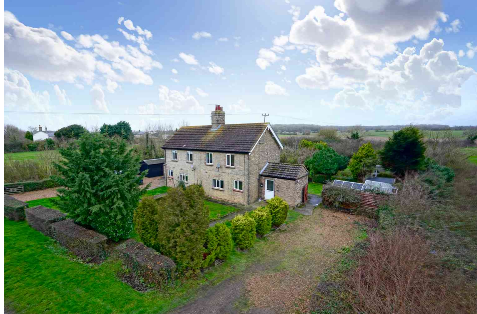
Stukeley Road, Abbots Ripton PE28 2LQ