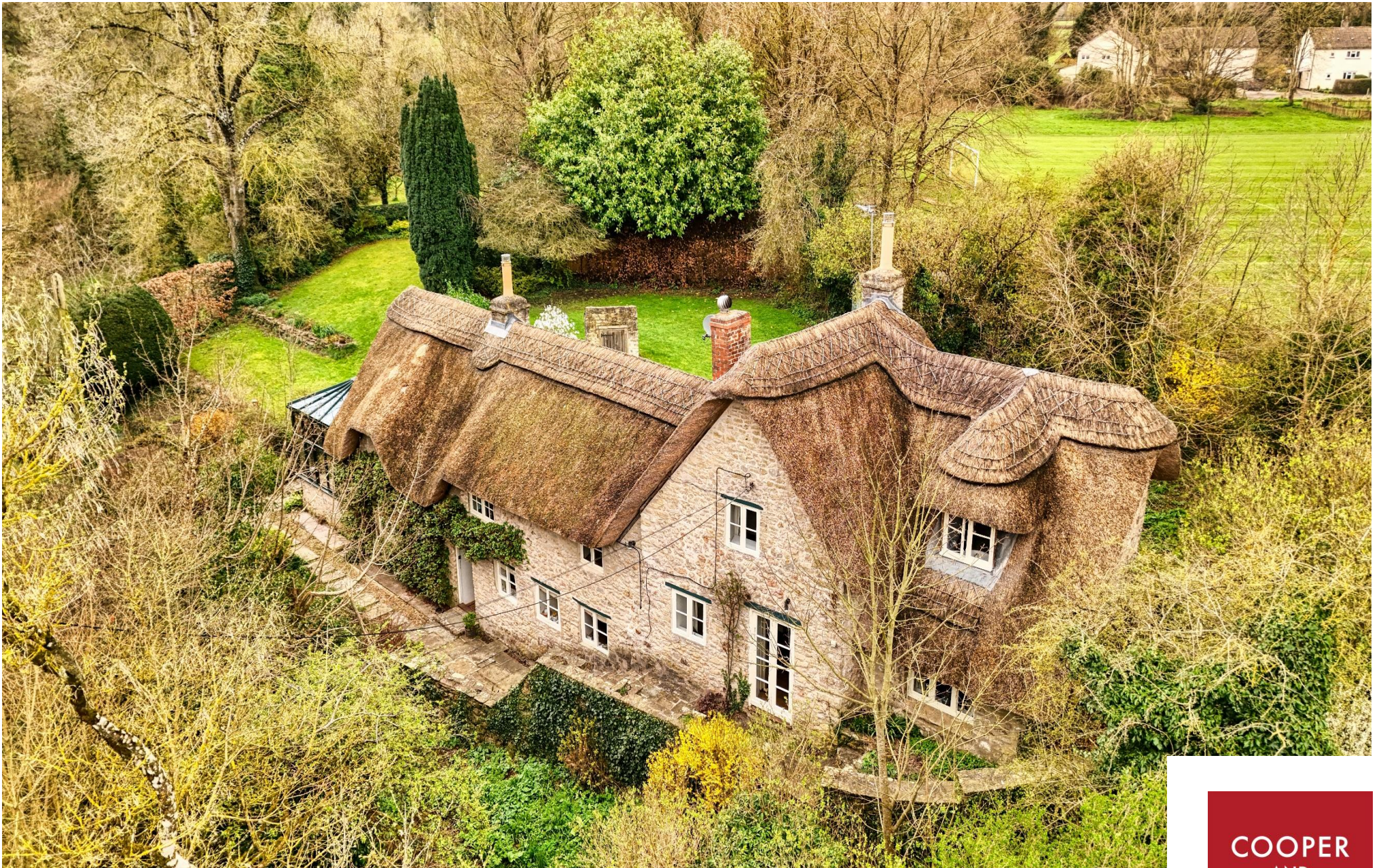
Drums Hill Cottage, Mells, BA11 3PX