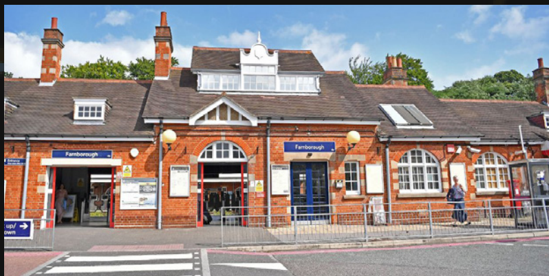
Farnborough Mainline Railway Station