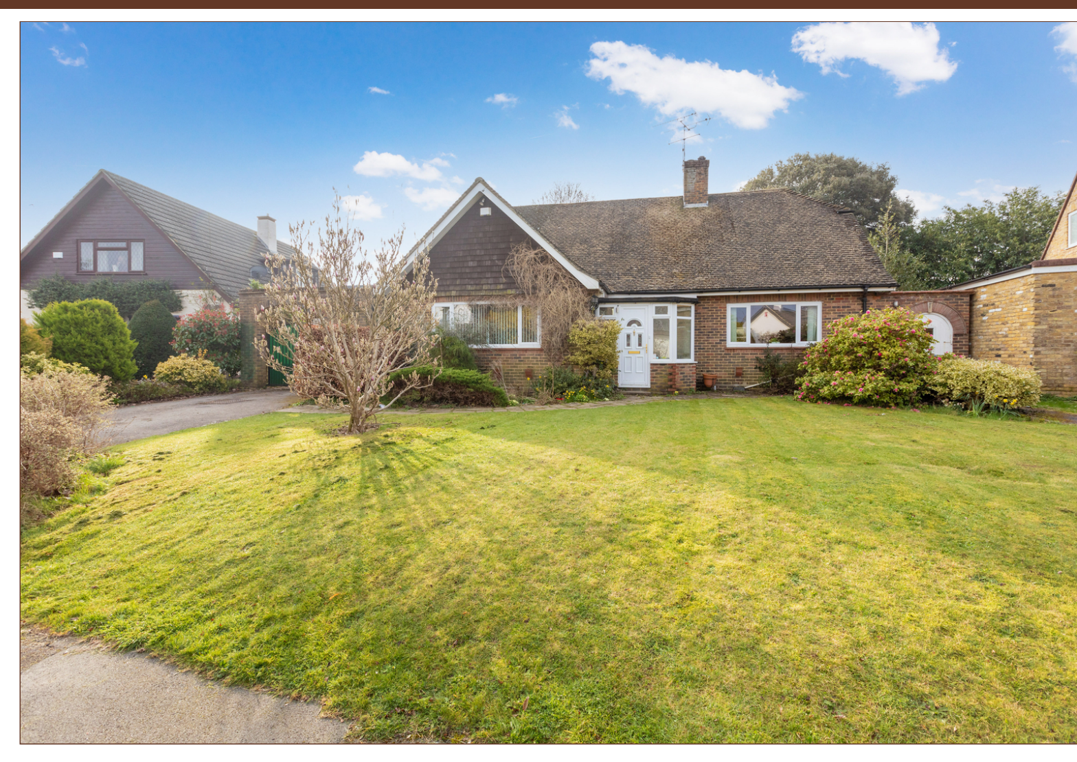
This four double bedroom detached family house is set on a 0.25 acre plot on a premier road in the north side of Burnham and offers flexible and spacious living accommodation stretching to approximately 2,828 sqft (including the garage).

The ground floor features four reception rooms with the inclusion of a 23ft sitting room, a 20ft conservatory, a 13ft dining room and a 13ft study/home office. There is also a 14ft refitted kitchen with adjoining utility room, a shower room, a double-sized bedroom with fitted wardrobes and a four piece ensuite bathroom, an entrance hall and porch.