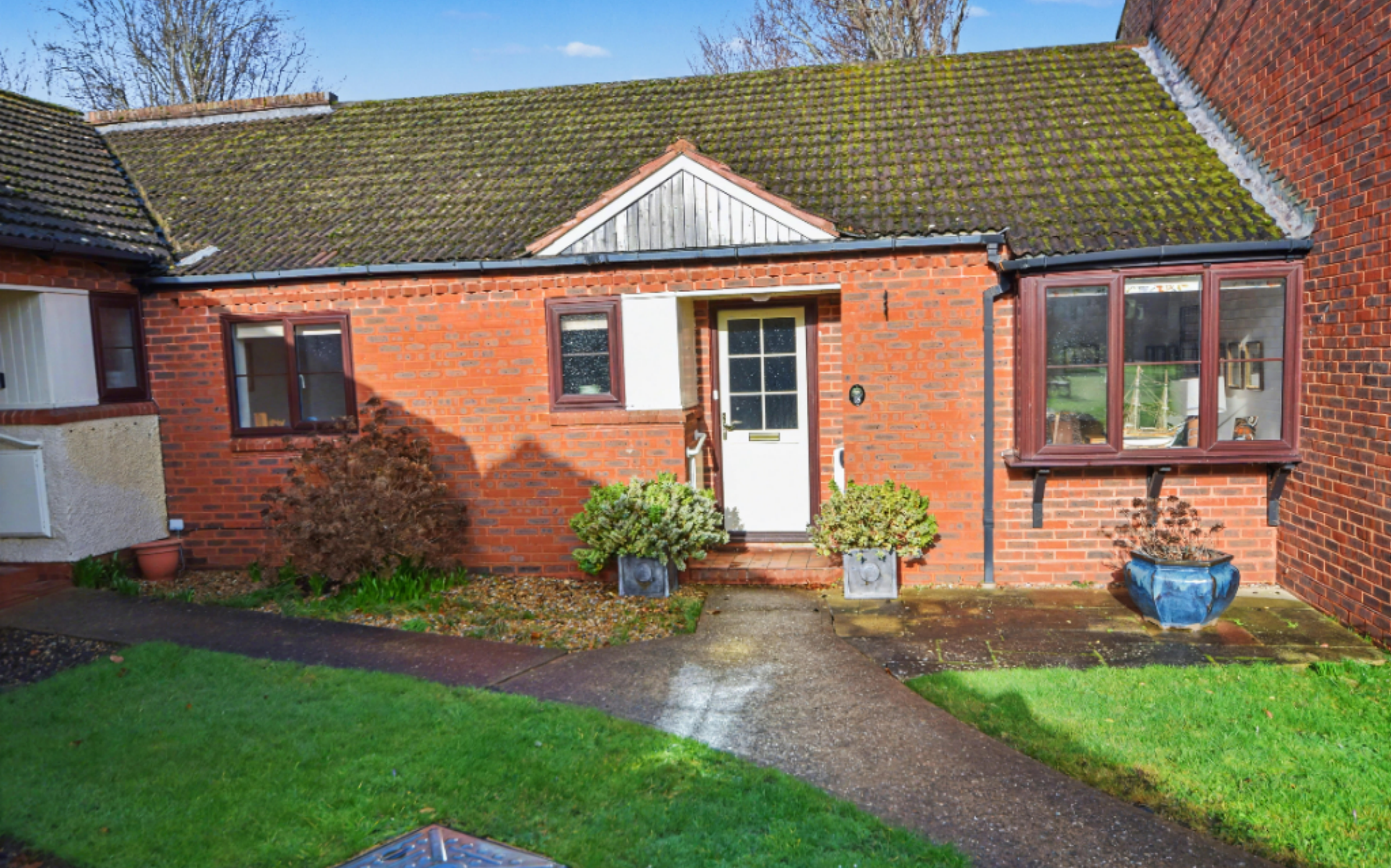
18 Stratford Court, Avon Road, Farnham, Surrey. GU9 8PG. Guide Price £385,000