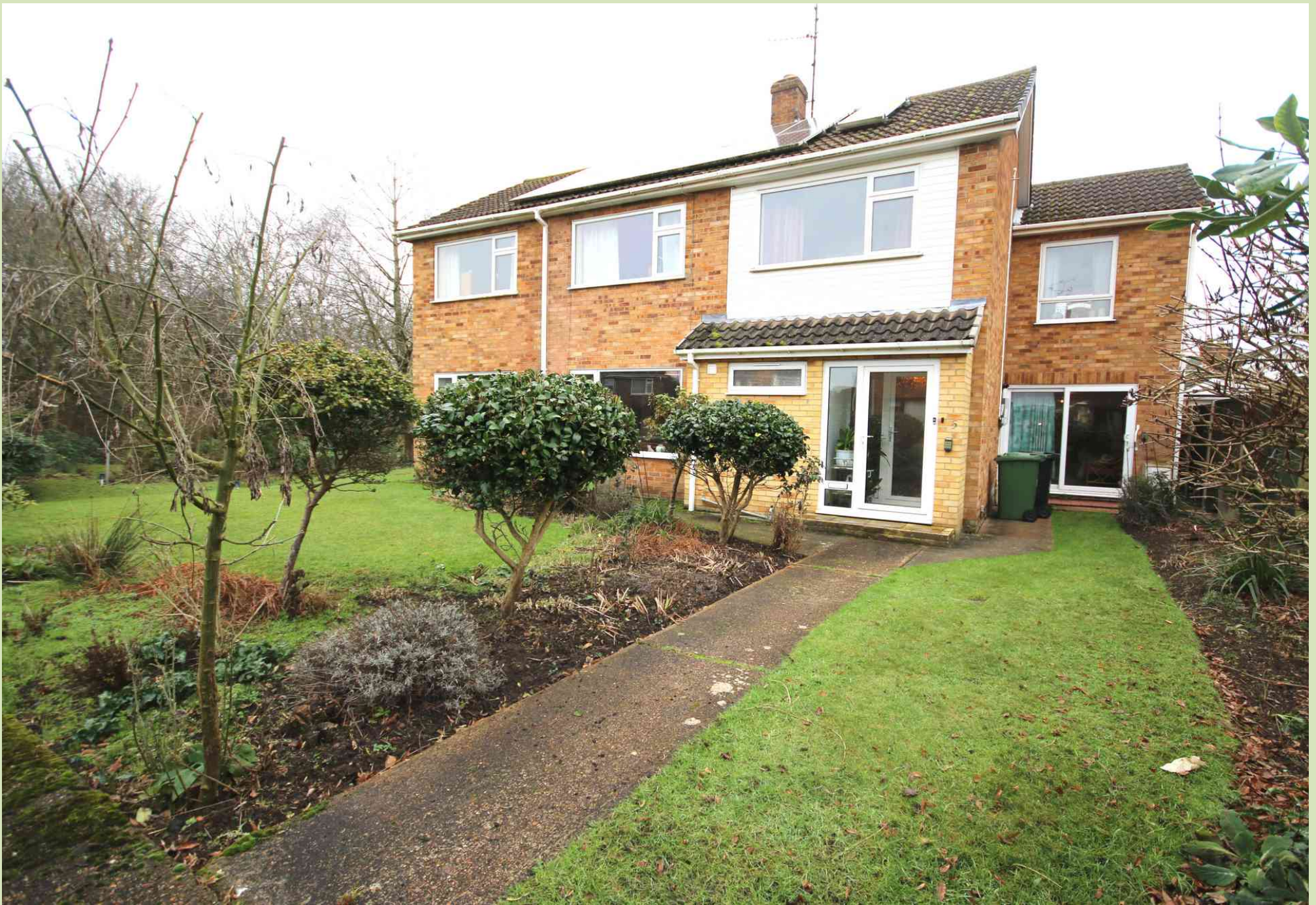
5 Briar Close, South Wootton Guide Price £425,000