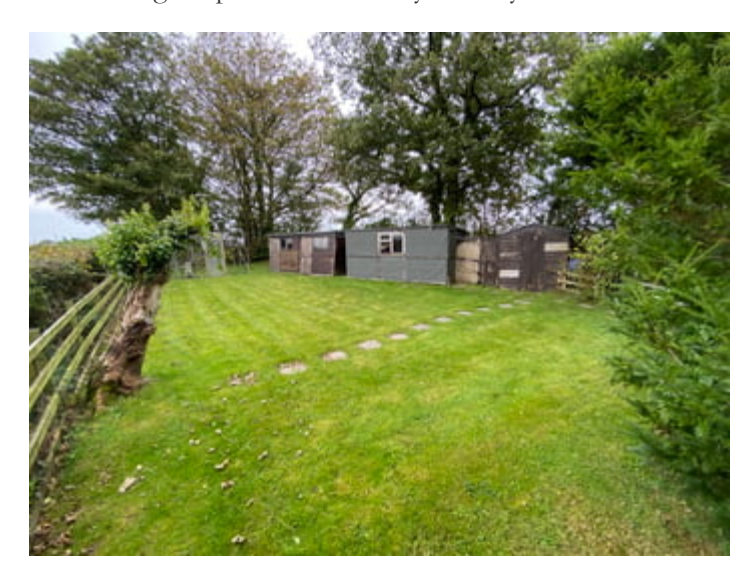
GARDEN (SECOND IMAGE)

The garden is largely triangular in nature having a delightful elevated yet sheltered position with mature shrubs, trees, level lawned areas and enjoying panoramic views over the surrounding unspoilt Aeron Valley countryside.