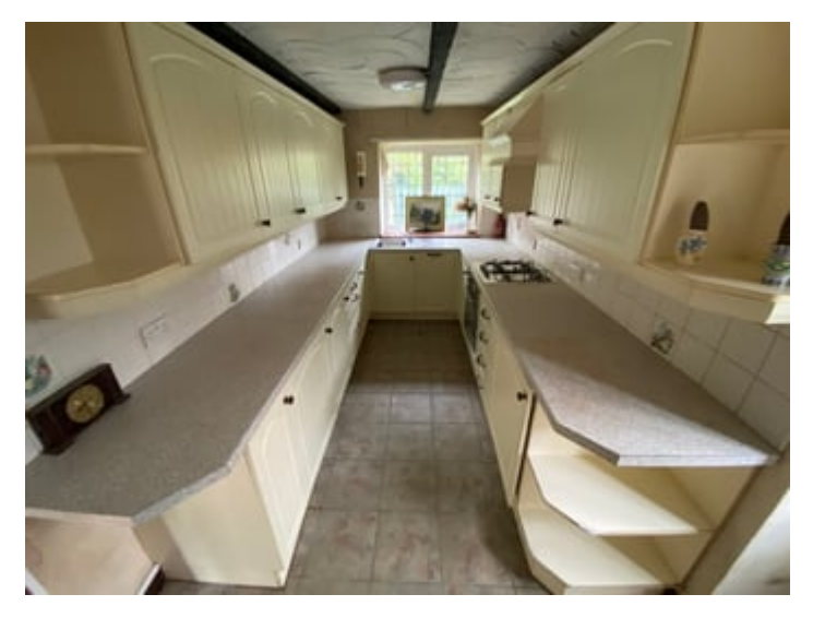
KITCHEN (SECOND IMAGE)

15' 2" x 7' 3" (4.62m x 2.21m). A cottage style fitted kitchen with a range of wall and floor units, stainless steel single sink and drainer unit, integrated automatic dishwasher, integrated Hotpoint automatic washing machine, integrated fridge, fitted Belling electric fan oven, LPG gas hob with extractor fan over, night storage heater, side entrance door to the garden area.