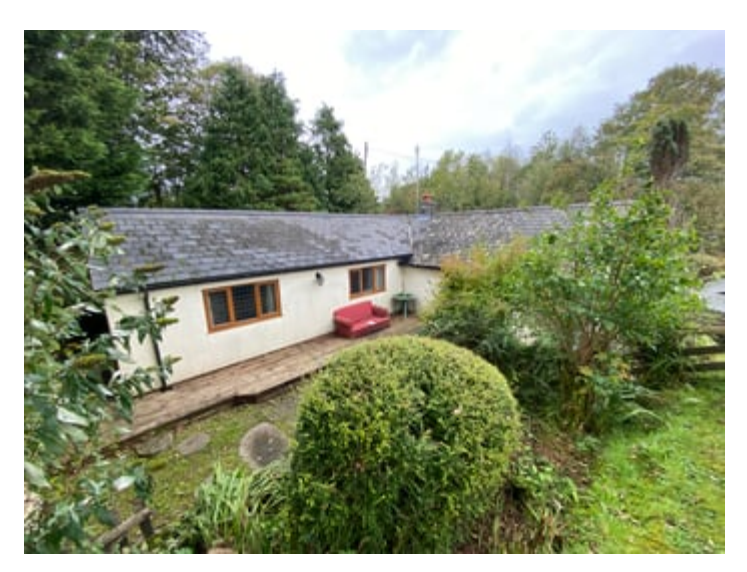
VIEWS FROM PROPERTY