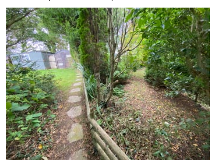
GARDEN (FOURTH IMAGE)