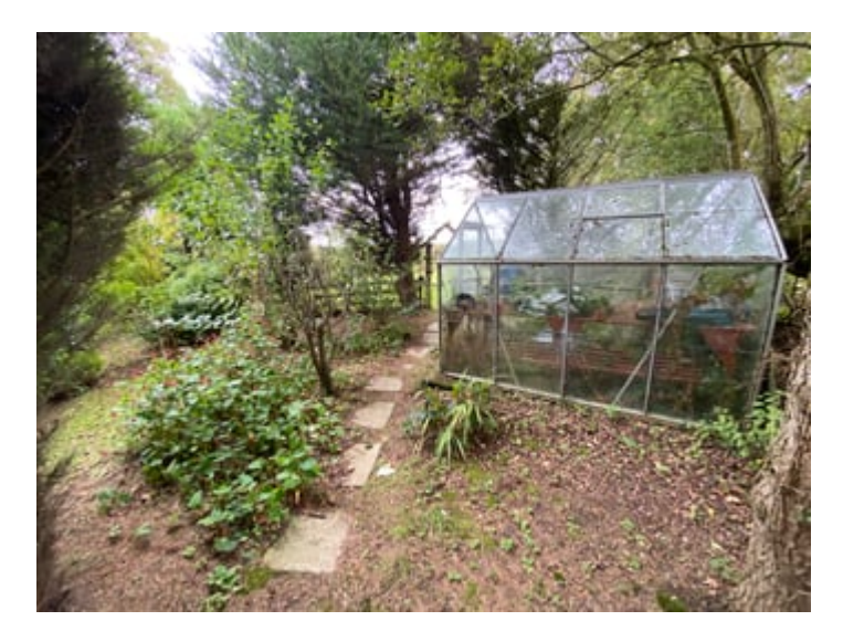
FORMER POLY TUNNEL