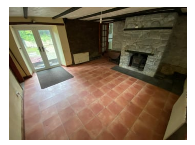
LIVING ROOM (SECOND IMAGE)

15' 4" x 15' 4" (4.67m x 4.67m). Full of character, with an original stone feature fireplace incorporating a multi fuel stove with a tiled hearth, exposed beamed ceiling, night storage heater, UPVC patio doors opening onto the rear garden area.