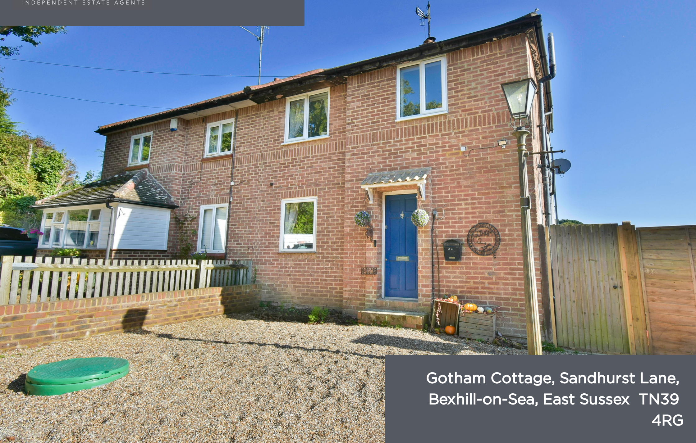
Gotham Cottage, Sandhurst Lane, Bexhill-on-Sea, East Sussex TN39 4RG