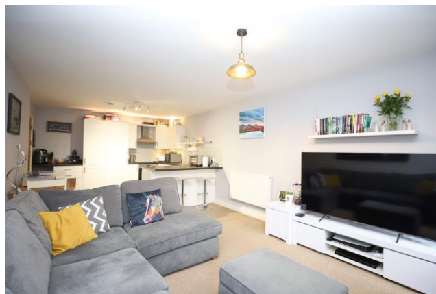
DINING LOUNGE AREA

BEDROOM 1 (16'3 x 8'6) Wood framed double glazed sash window to the front, built-in wardrobes and door to the en-suite shower room.