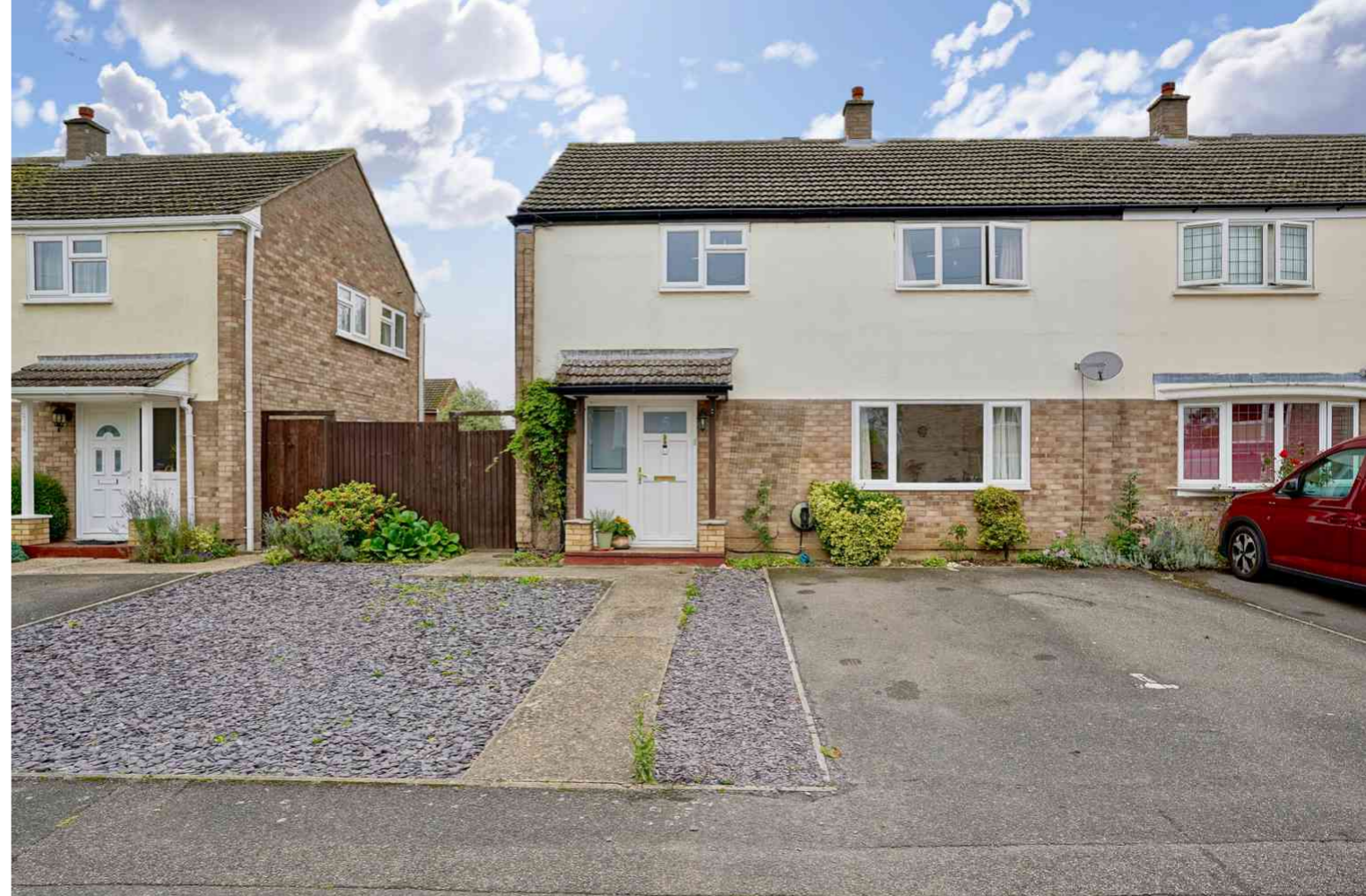
Williams Close, Brampton PE28 4SW