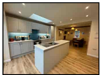
Ty Twt 10 Masons Row, Aberaeron, Ceredigion. SA46 0AA.