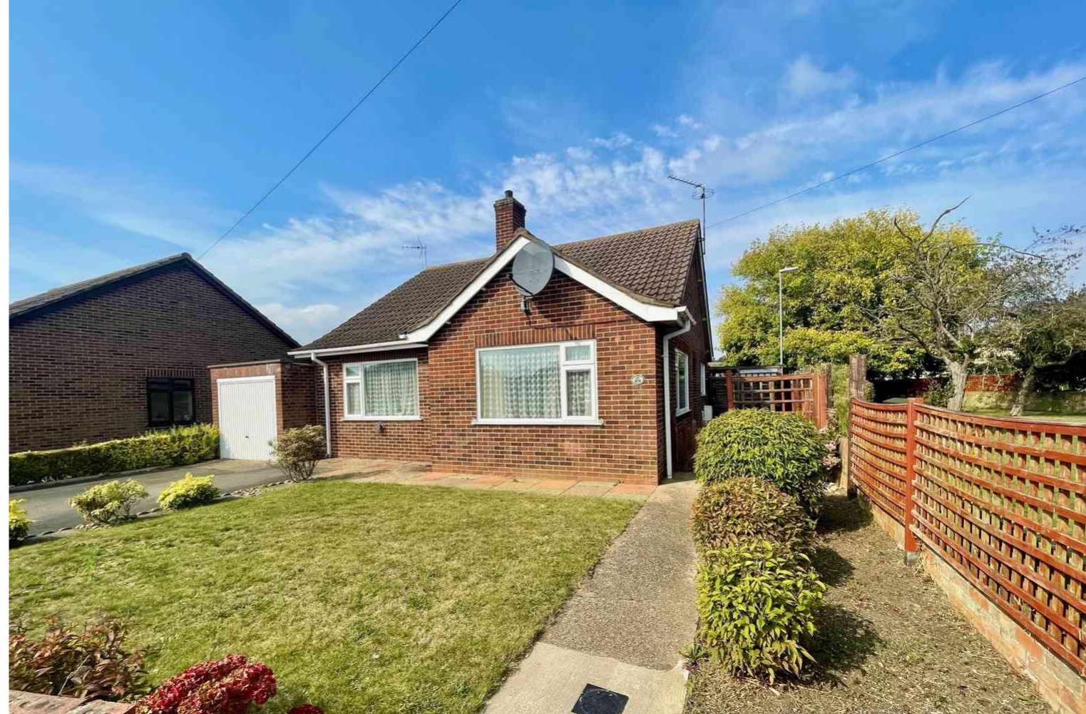
Desborough Road, Hartford PE29 1RU