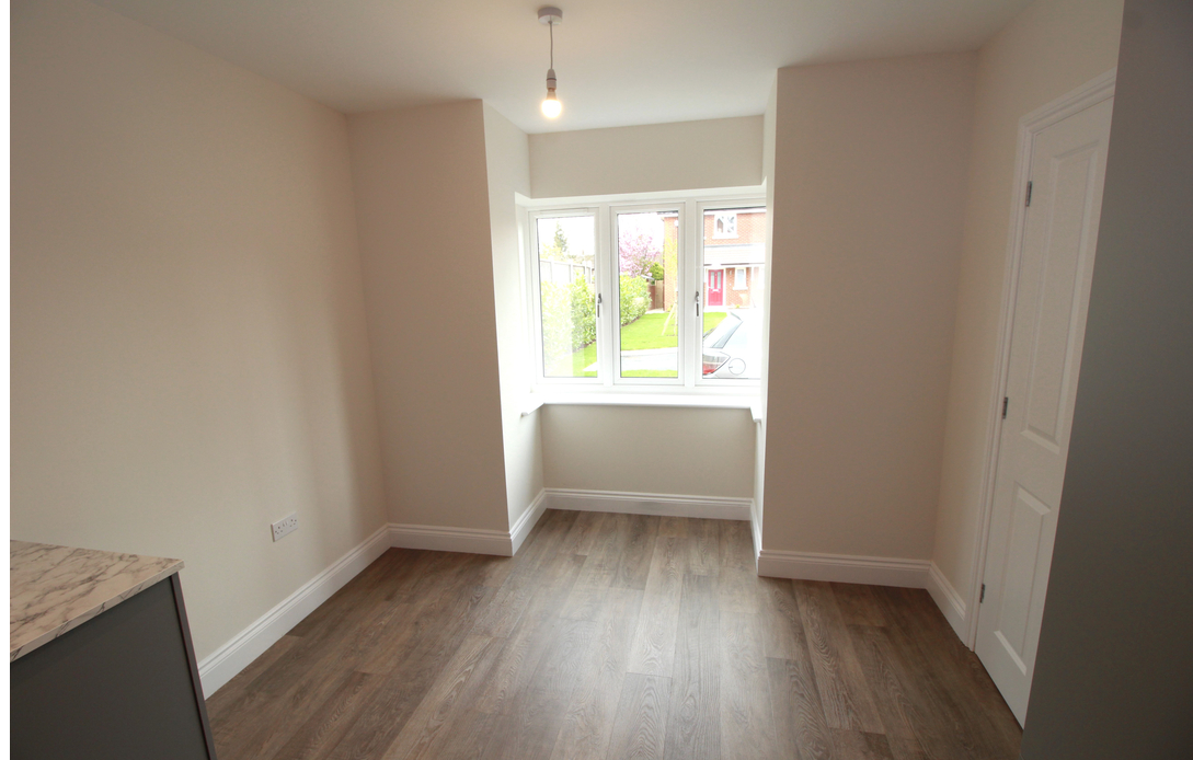
Plot 3, 115 Feltham Hill Road, Ashford, Surrey TW15 1HE £649,950 - Freehold