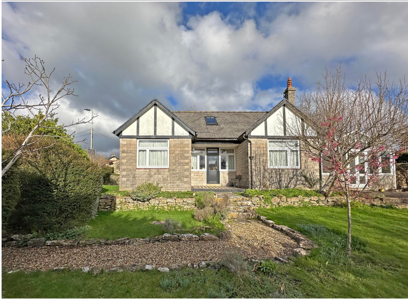
Winsley Road, Bradford on Avon