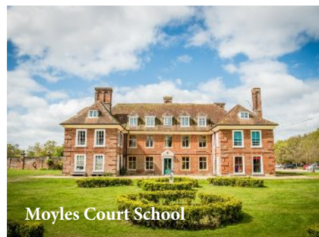
Moyles Court School