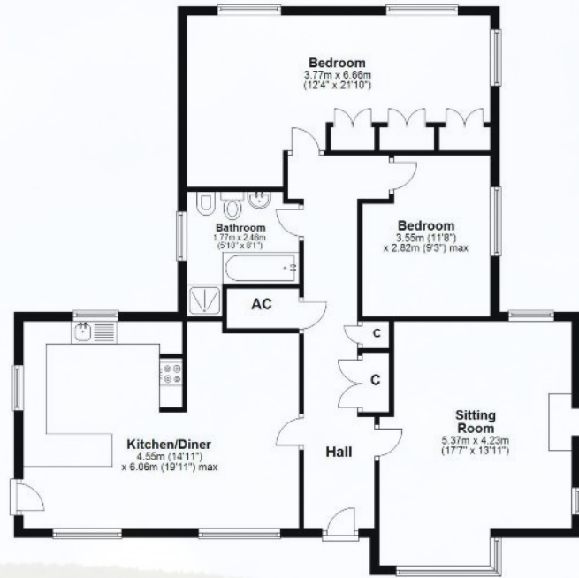
Ground Floor Approx. 174.8 sq. metres (1881.3 sq. feet)