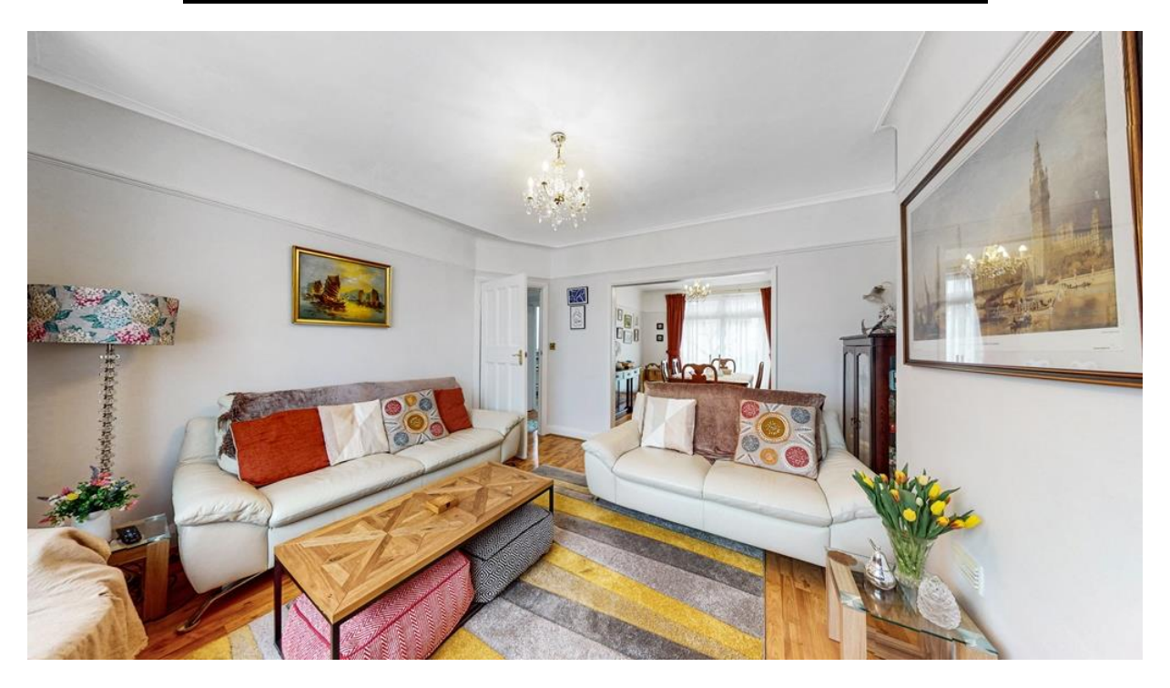
EPC Rating: D

We are pleased to be able to offer for sale this well presented semi-detached house and located in this desirable residential road parallel to Dollis Hill Lane. Benefits include:-