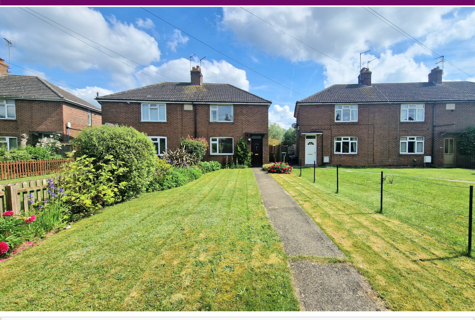
55 Stowe Road, LANGTOFT, Lincolnshire PE6 9NE