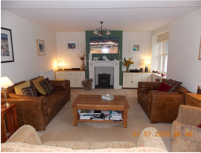
LIVING ROOM (SECOND ANGLE)

25' 0" x 15' 0" (7.62m x 4.57m). With a feature fireplace with a Calor Gas Real Flame effect wood burner stove, wood effect sash windows with Roman blinds, multiple electrical points, telephone and T.V. point, part carpeted and part quarry tiled flooring. In all an exceptional Family room.