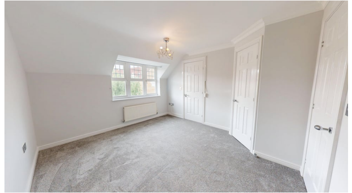
Master Bedroom & En Suite