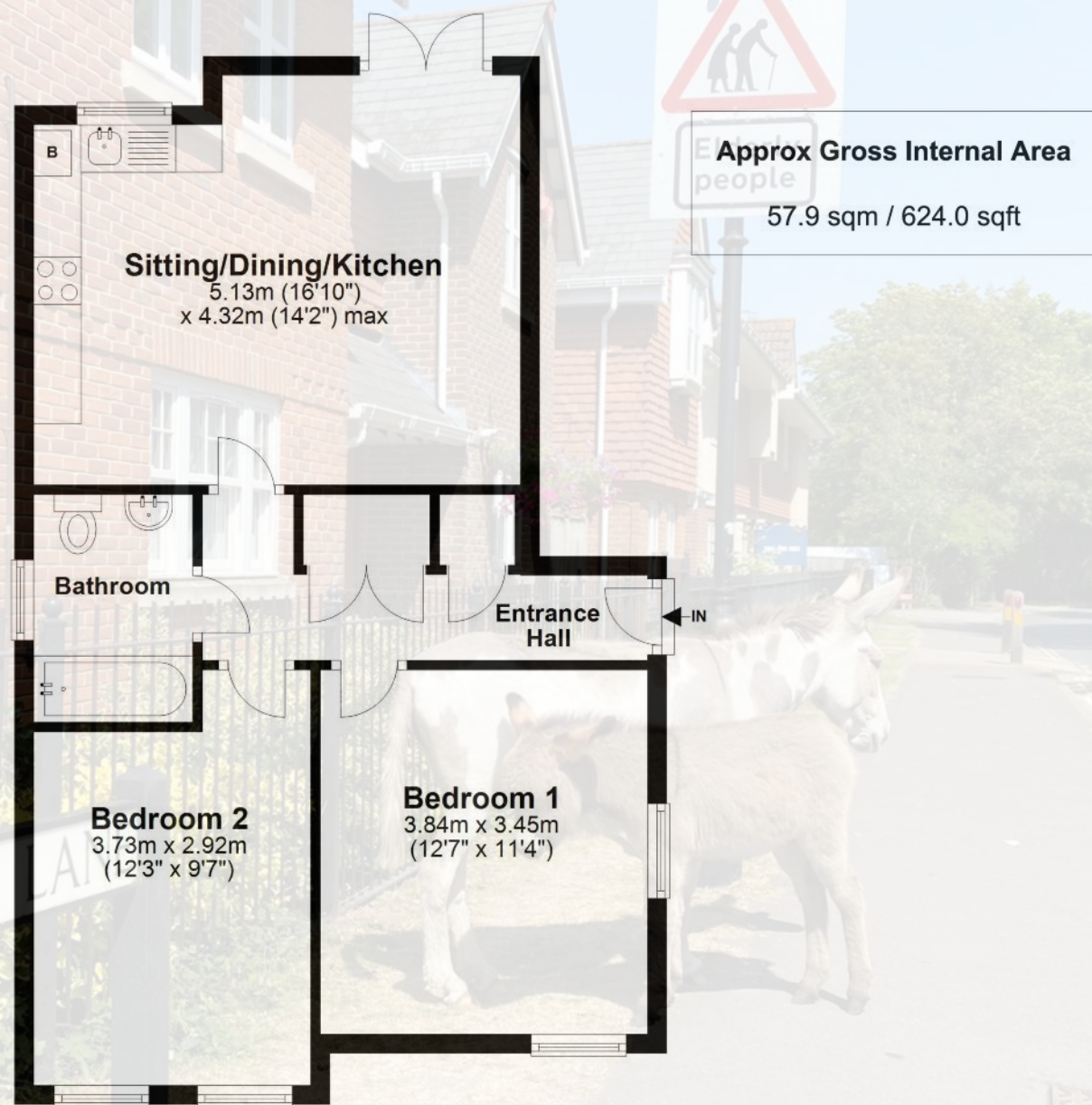
Illustration for identification purposes only; measurements are approximate, not to scale. EPC New Forest Plan produced using PlanUp.