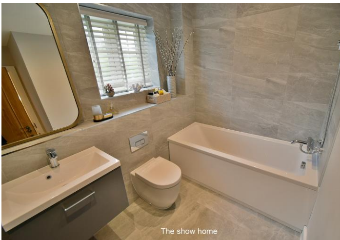
The show home