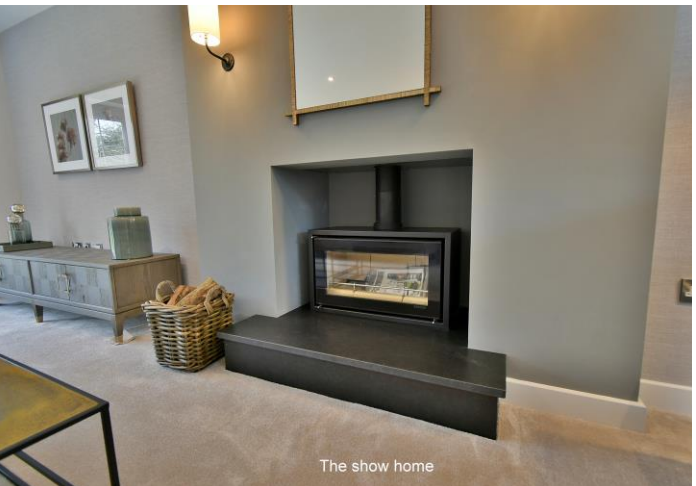
The show home