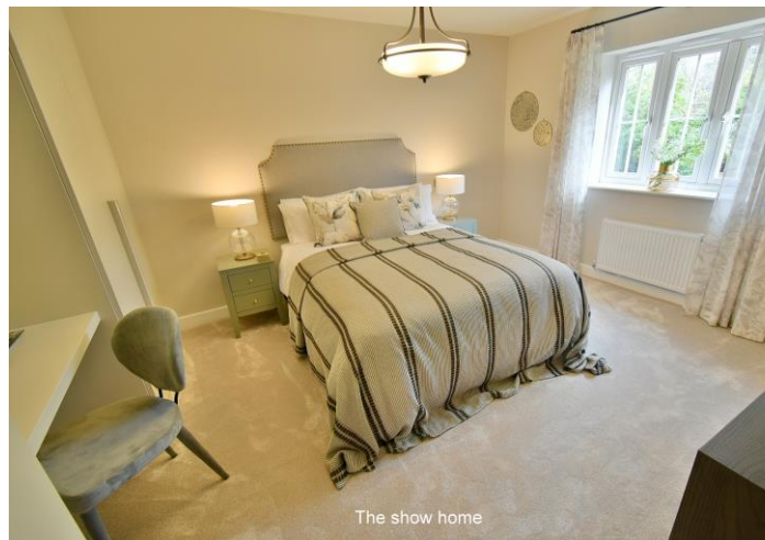
The show home