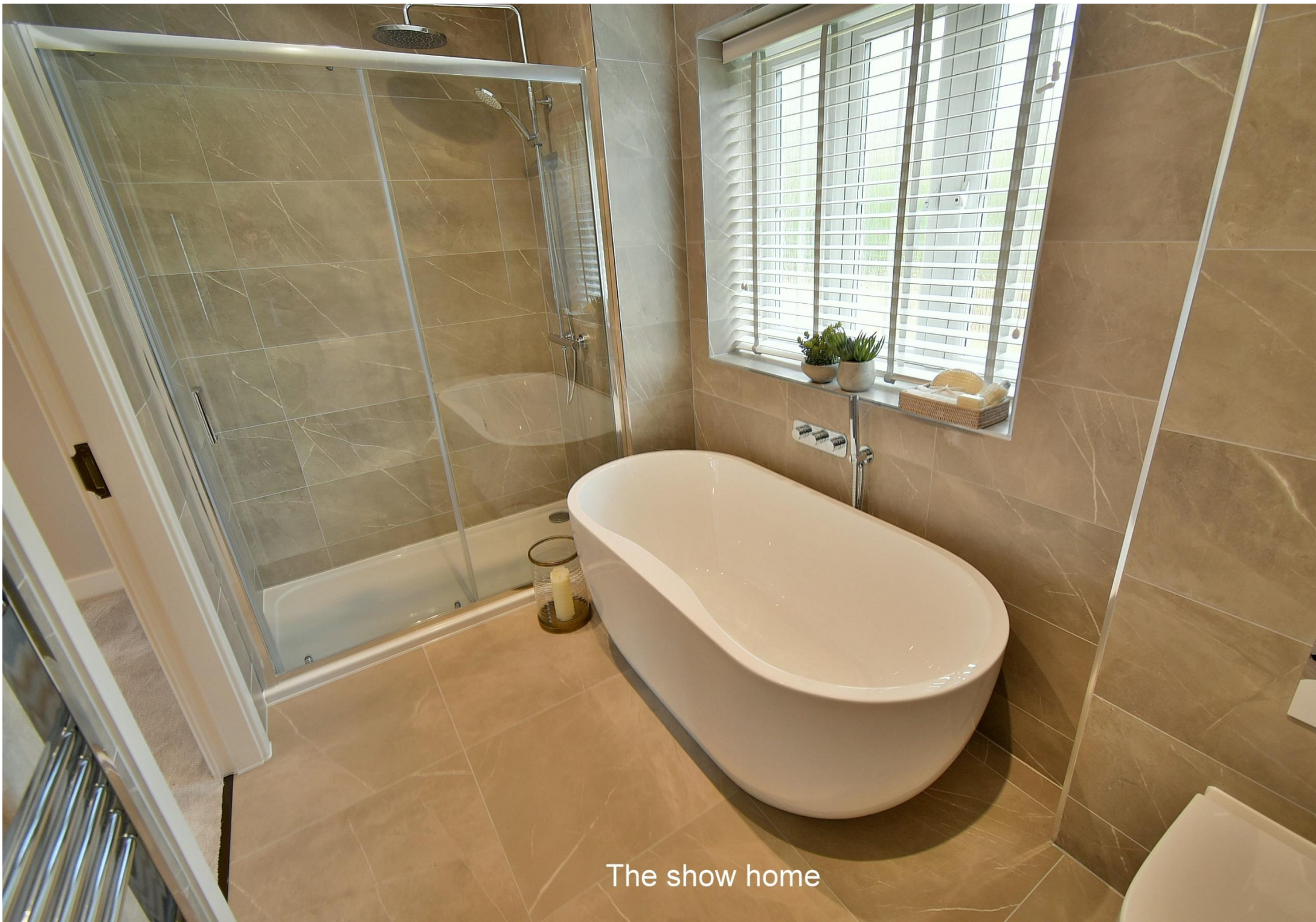
The show home