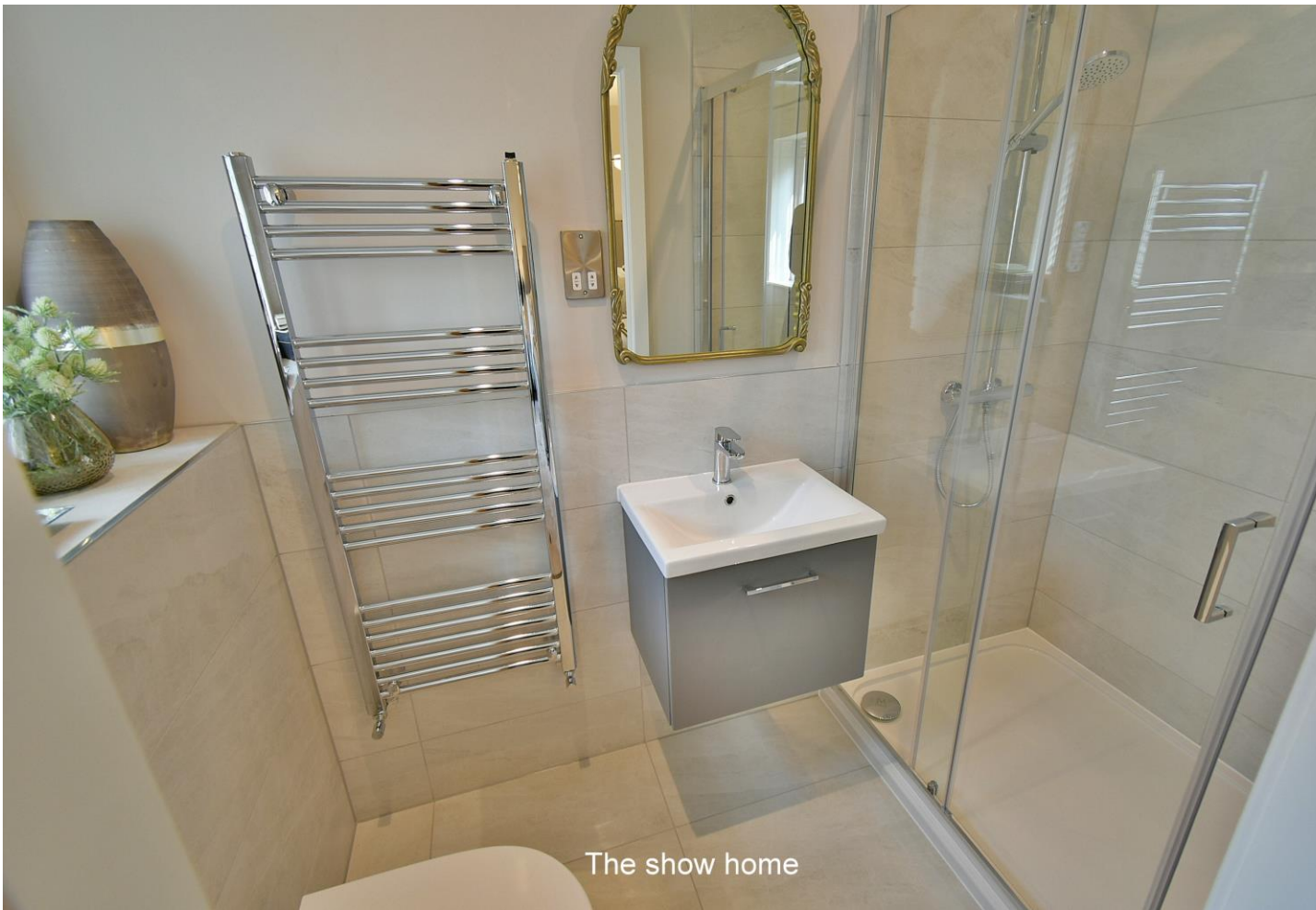
The show home