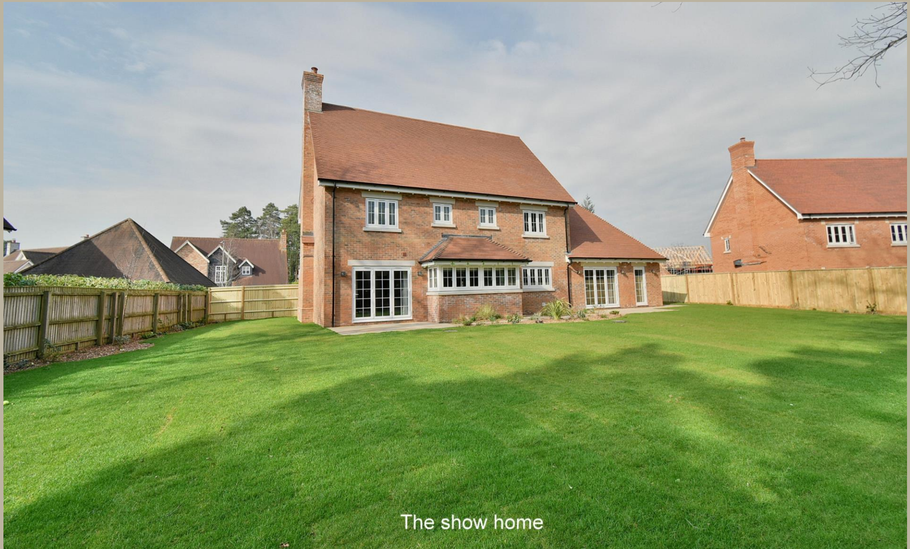
The show home

6-8 Victoria Road, Ferndown, Dorset, BH22 9HZ Tel: 01202 890890 Email: ferndown@hearnes.com