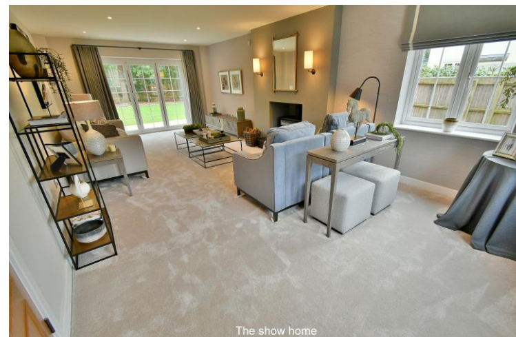
The show home