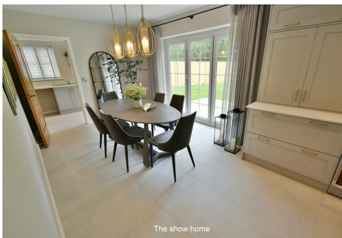
The show home