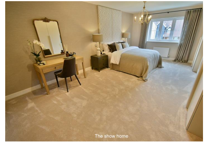
The show home