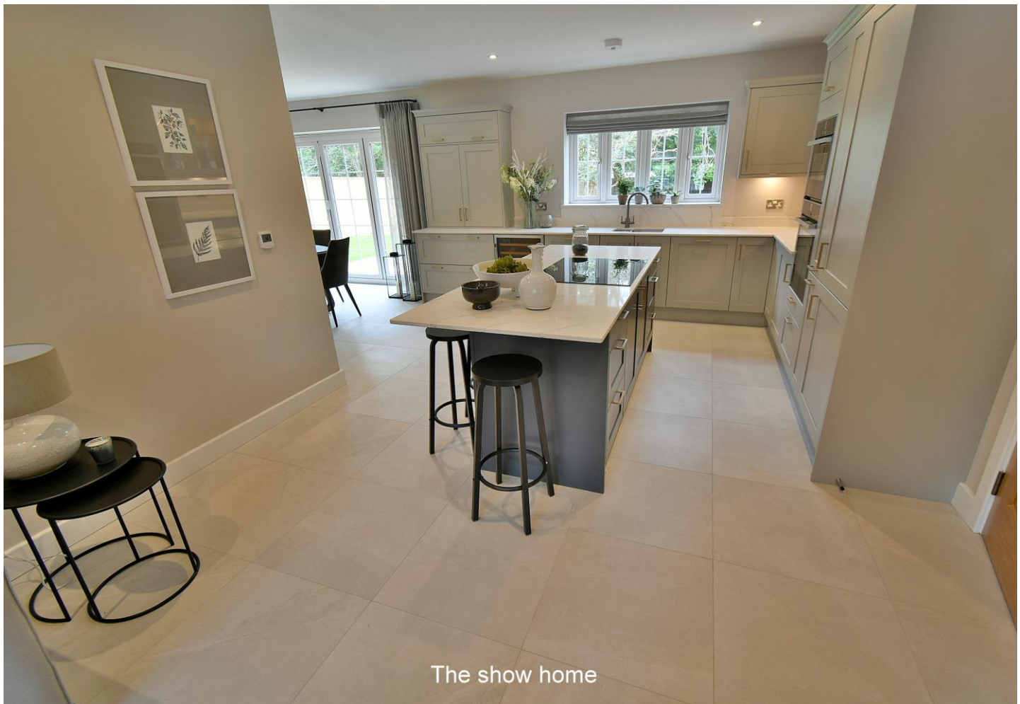
The show home