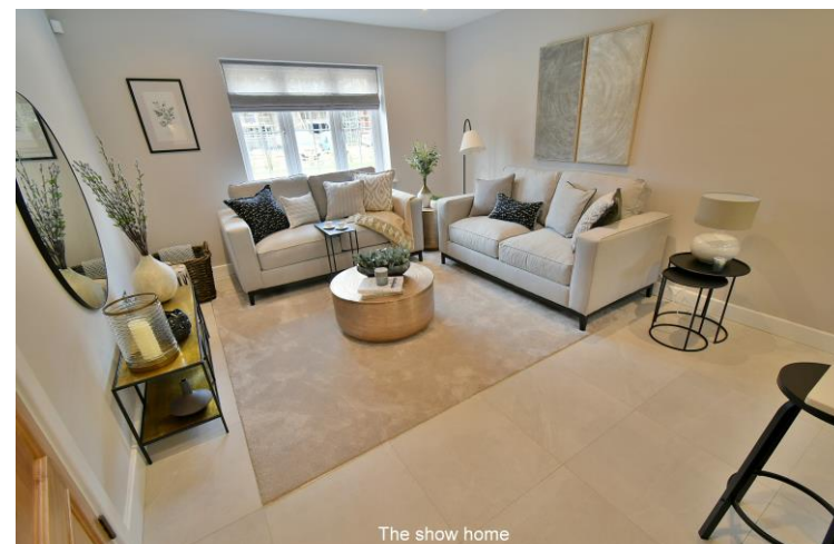
The show home