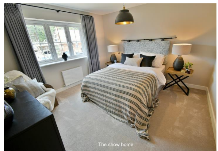
The show home