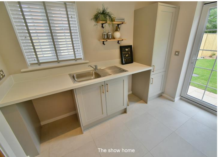
The show home