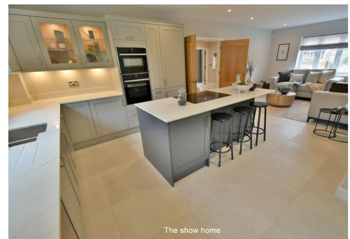
The show home