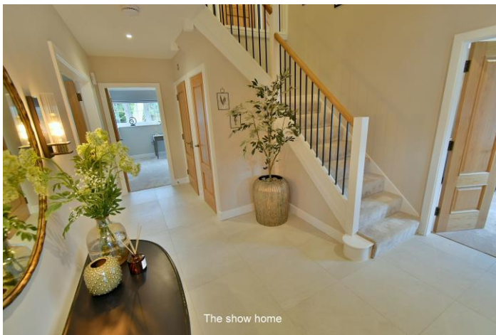
The show home