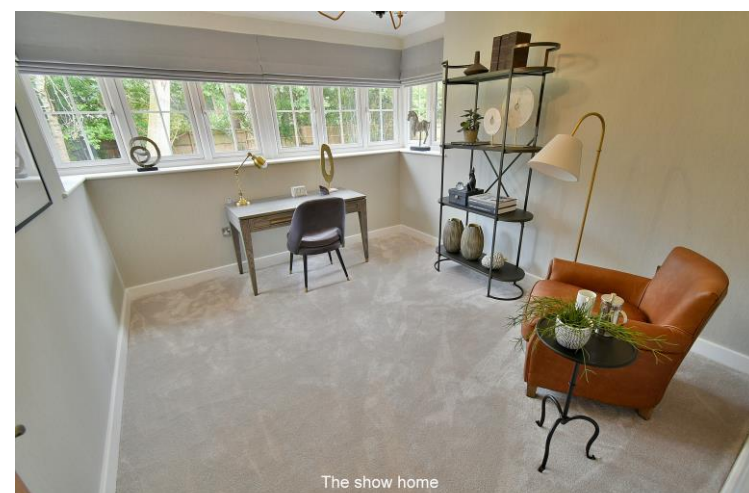
The show home