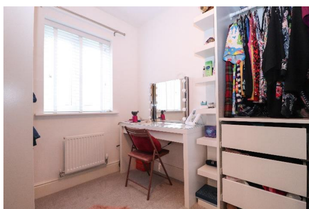
BEDROOM 5 / OFFICE

BATHROOM (10'4 max x 6'8 max) Four piece suite comprising of walk-in fully tiled shower cubicle, panelled bath, wash hand basin and WC. Double glazed frosted window, spotlights to ceiling, heated towel rail and wood effect flooring.