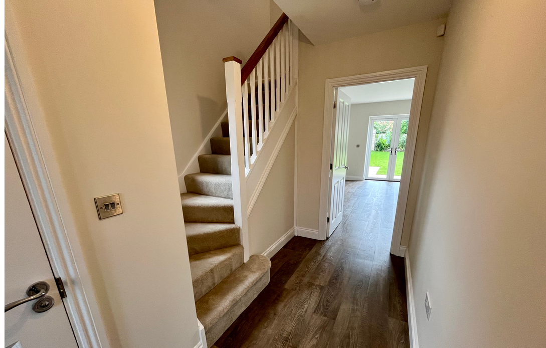
Plot 3, 115 Feltham Hill Road, Ashford, Surrey TW15 1HE £632,950 - Freehold