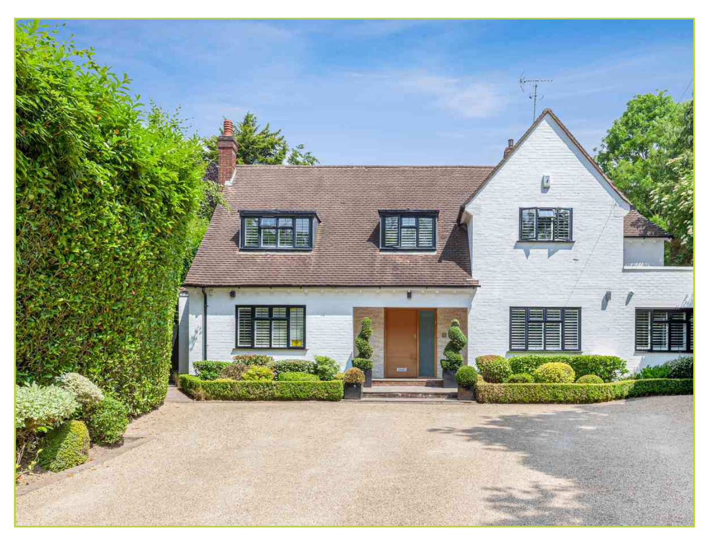
Adelaide Close, Stanmore. HA7 3EL. £3,250,000 Freehold

An Elegant Detached Residence set behind a secluded driveway occupying a prominent, semi secluded position on the private Aylmer Drive Estate, which is one of Stanmore's most sought-after locations perfectly conceptualised for family living situated close to the open expanse of Bentley Priory nature reserve.