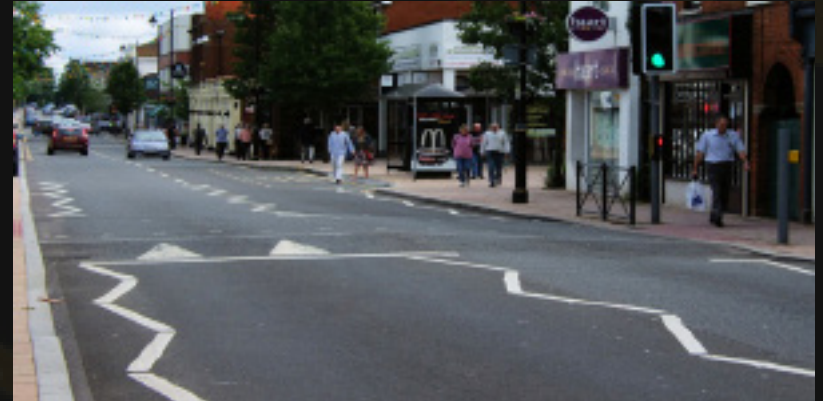
Fleet High Street