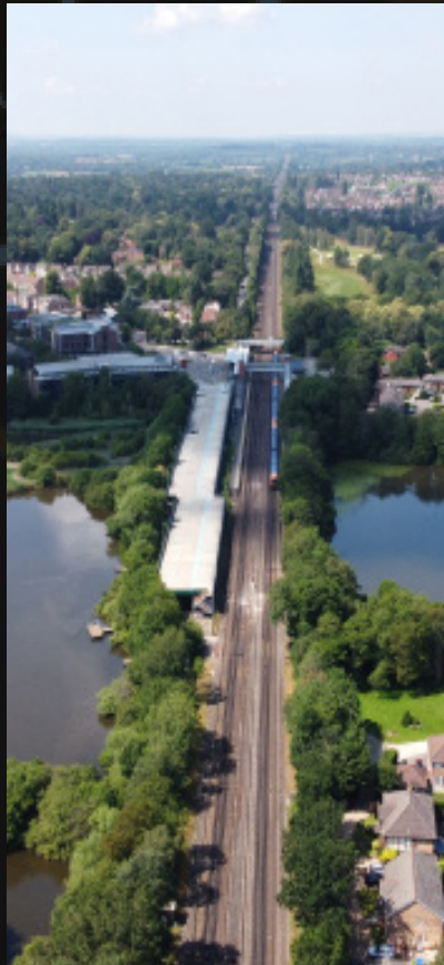
Rail Line/Fleet Pond