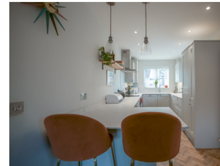
11a High Street, Langford, Bedfordshire, SG18 9RP