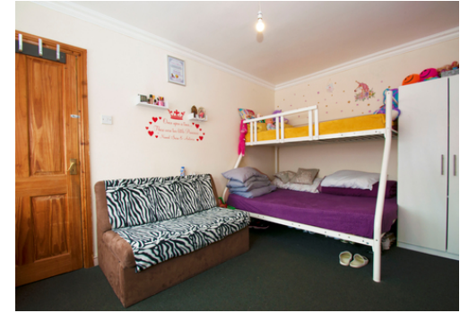
1 Mirador Crescent, Slough, Berkshire. SL2 5JX. £510,000