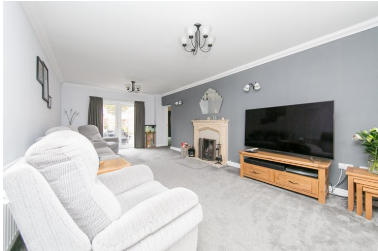
23' 3" x 12' 0" (7.09m x 3.66m) Smooth ceiling, carpet, radiator, double glazed windows to front, television & telephone point, open fireplace with surround, double glazed French doors to rear