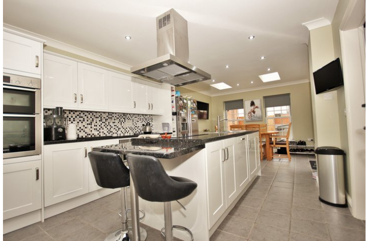
24' 4" x 14' 4" (7.42m x 4.37m) Smooth ceiling, tiled floor with under floor heating, double glazed window to rear, matching wall & base units, centre island, roll edge worktops, sink with inset drainer unit, stainless steel extractor hood, induction hob, tiled splash back, integrated double oven, integrated dishwasher, space for American style fridge / freezer, door to utility room,