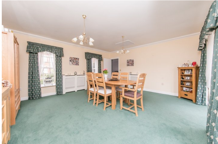
16' 7" x 16' 0" (5.05m x 4.88m) Smooth ceiling, radiator, carpet, double glazed windows to front, double glazed French doors to rear, loft access