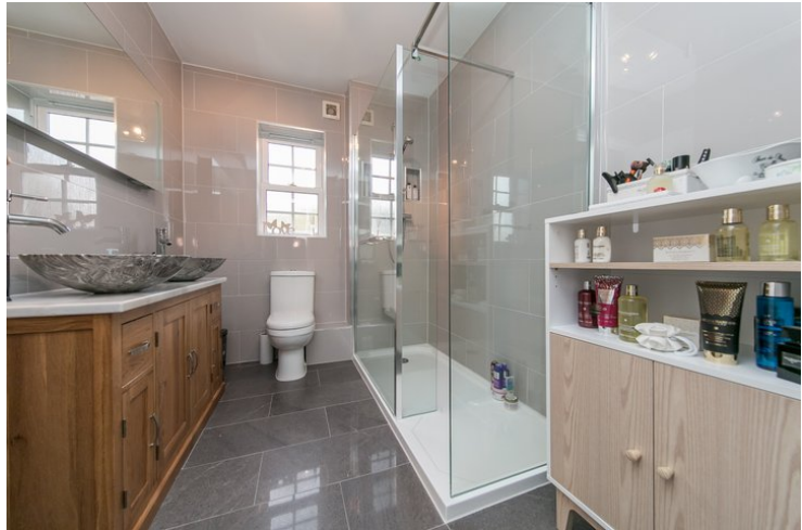
Smooth ceiling, heated towel rail, opaque double glazed window to rear, low level W/C, his and her basins with vanity unit underneath, extractor fan, double walk in shower, tiled floor, fully tiled walls, shaver point