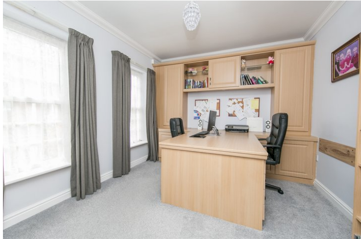
11' 6" x 10' 4" (3.51m x 3.15m) Smooth ceiling, carpet, double glazed windows to front, television & telephone point