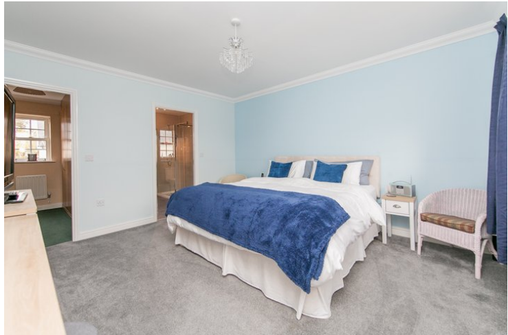
13' 8" x 12' 2" (4.17m x 3.71m) Smooth ceiling, radiator, double glazed window to front, television point, doors to En-suite & dressing room,